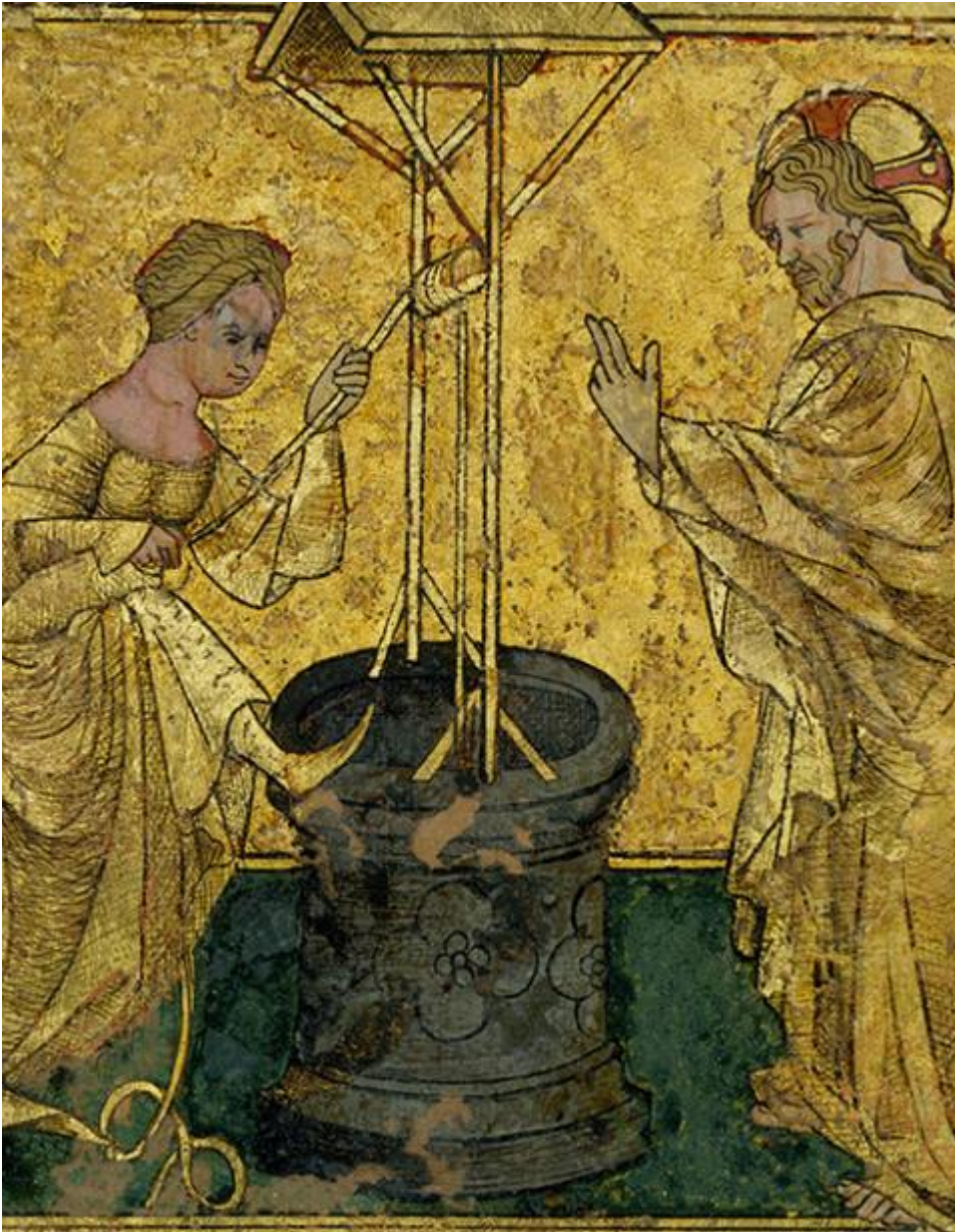
"Jesus and the Samaritan Woman at the Well," detail, circa 1420 (Metropolitan Museum of Art)

What began with a simple request led to a liturgical discussion between a theologian in the making and the Source of theology. Their dialogue led to a whole town encountering Jesus.