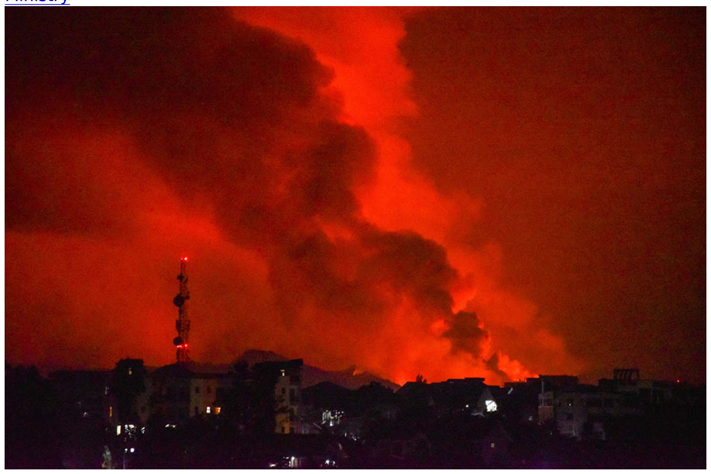
Smoke rises from the volcanic eruption of Mount Nyiragongo near Goma, Congo, May 22.