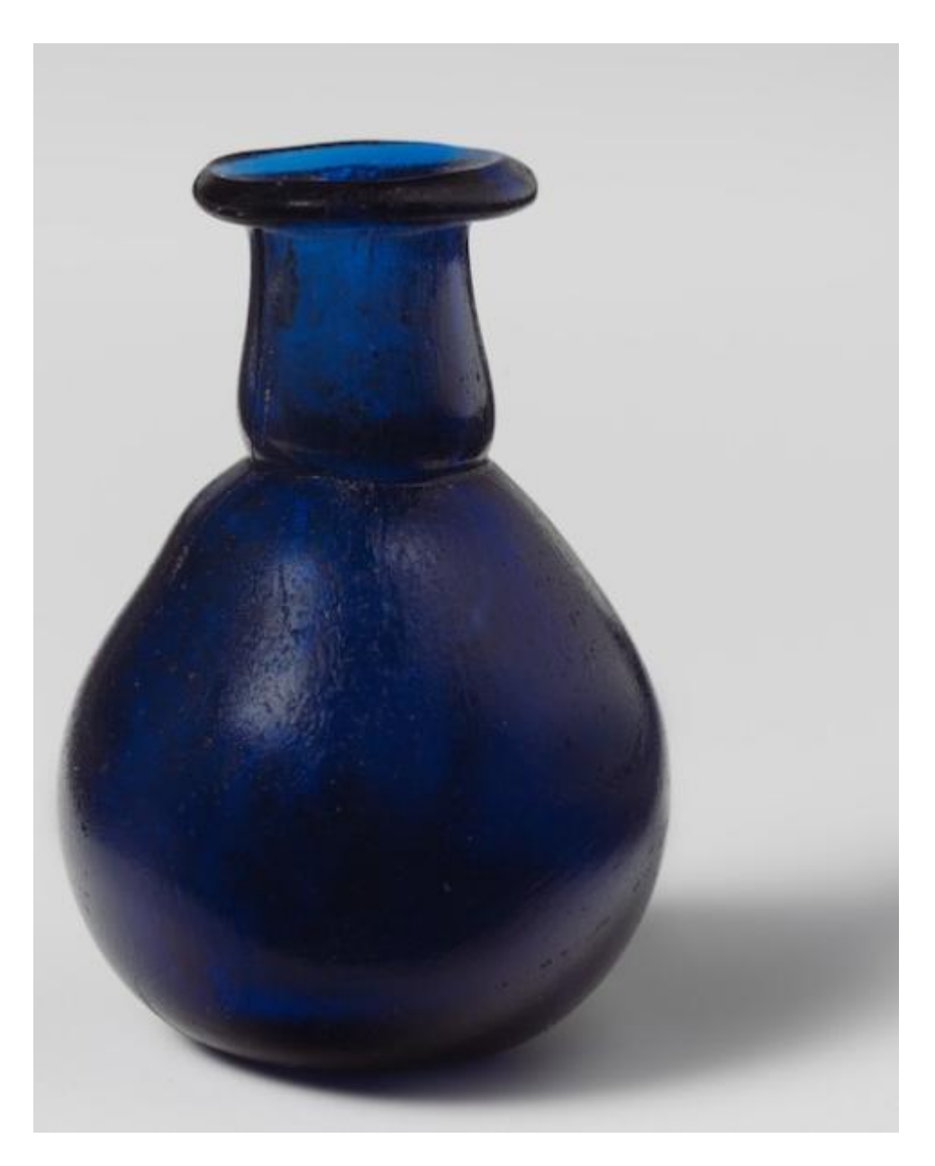
Roman blown glass perfume bottle, first century A.D. (Metropolitan Museum of Art)

Who are they who go to the orchard-garden, at dawn? They have no idea what will happen to them, yet there they go, faithful and confident, to pay homage to the One who loved them.