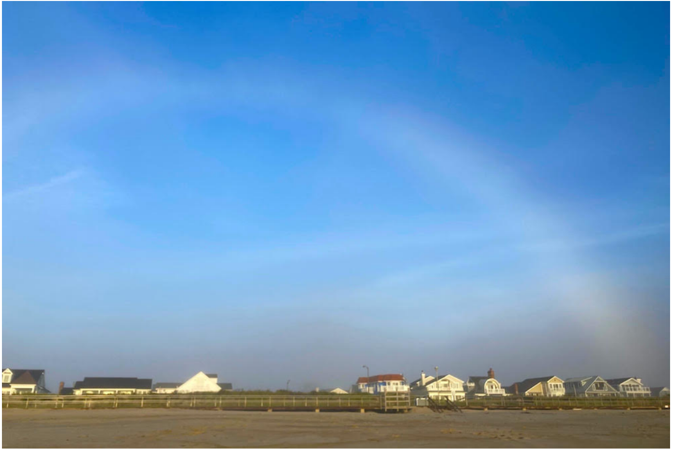
A fogbow over Spring Lake, New Jersey, November 2020