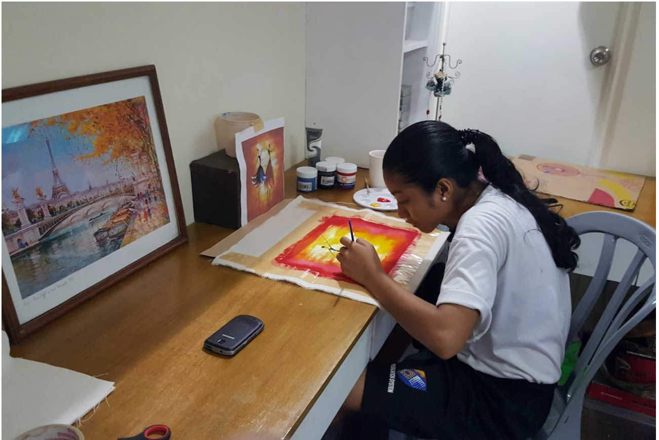
Girls in the School of Life make crafts to earn money for their savings and to sell to help support the school.