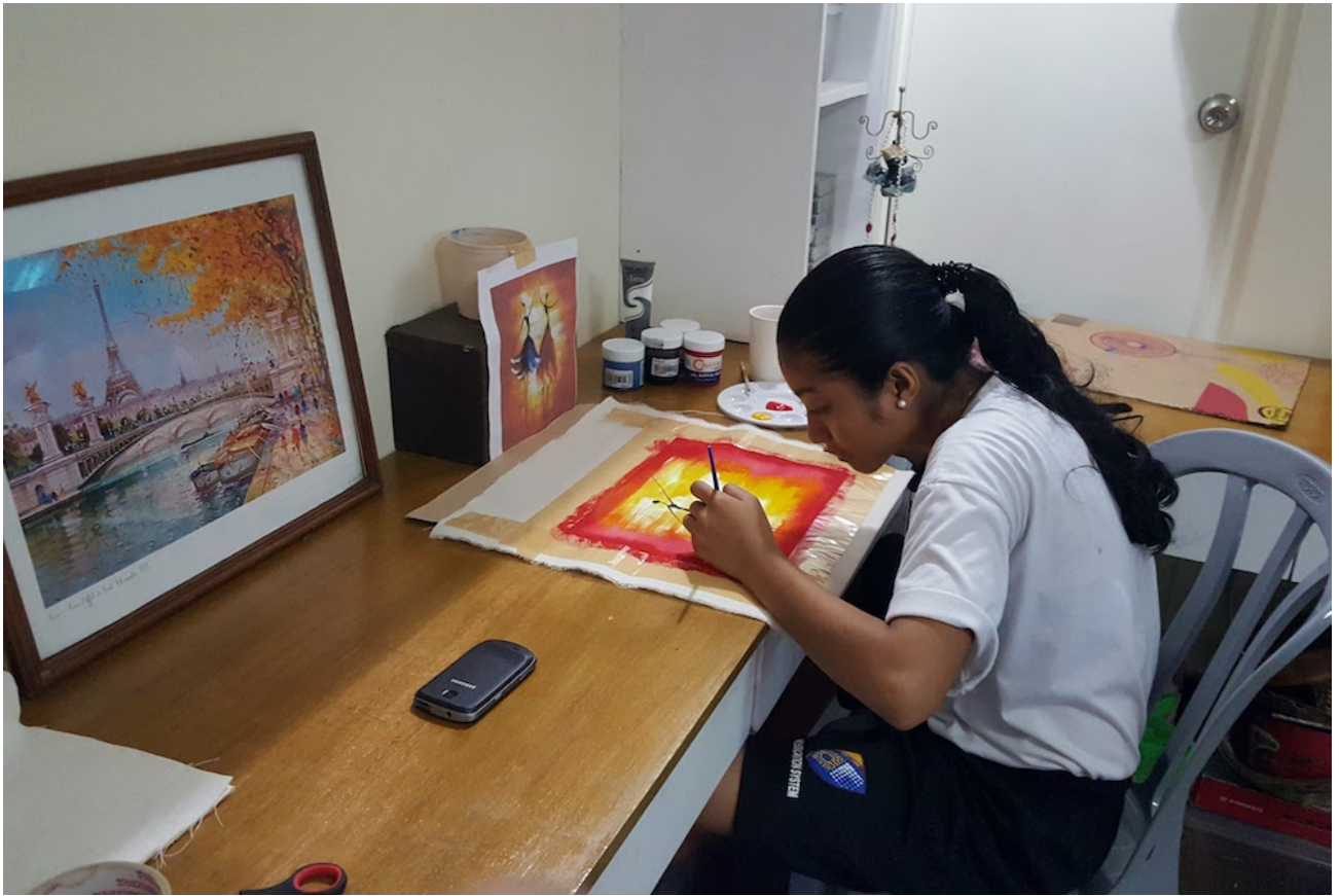
Girls in the School of Life make crafts to earn money for their savings and to sell to help support the school.