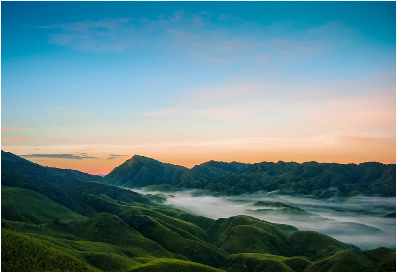
Dzukou Valley, Nagaland, India