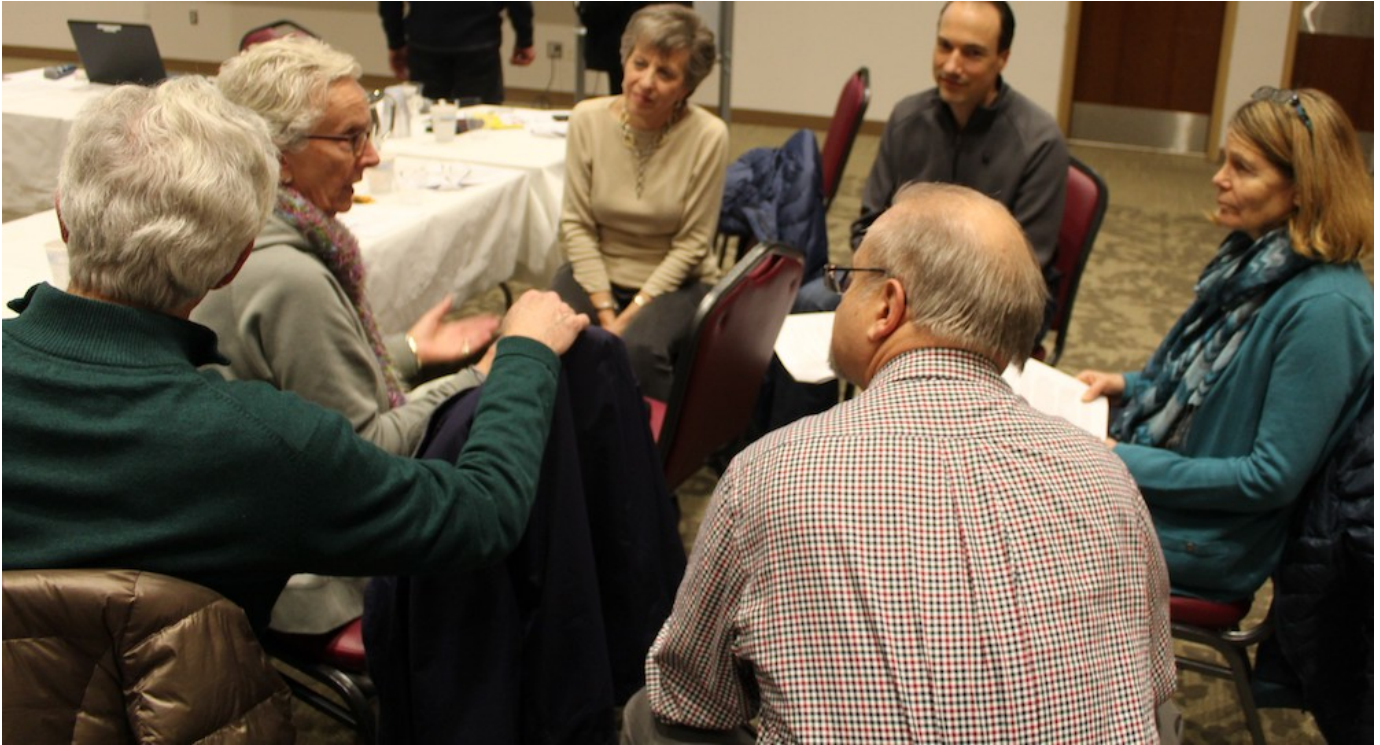
Parishioners from St. Rose of Lima Parish and members of Congregation B'Nai Jeshuran of Short Hills participate in a discussion group.

out those images are unfair, patronizing and just not true. It was important to me that they understood the work and power of women religious and what we have been able to accomplish throughout the centuries.