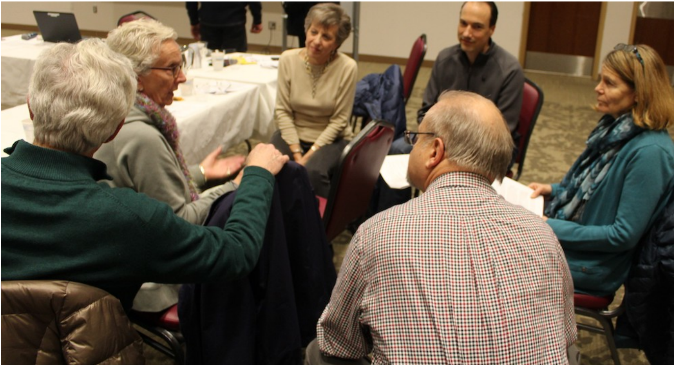
Parishioners from St. Rose of Lima Parish and members of Congregation B'Nai Jeshuran of Short Hills participate in a discussion group.

out those images are unfair, patronizing and just not true. It was important to me that they understood the work and power of women religious and what we have been able to accomplish throughout the centuries.