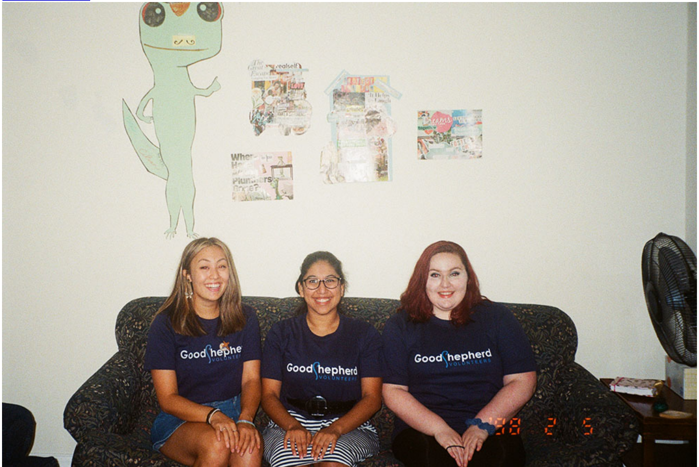
A film photo of my community and me (left) in the beginning of our service year in August 2020