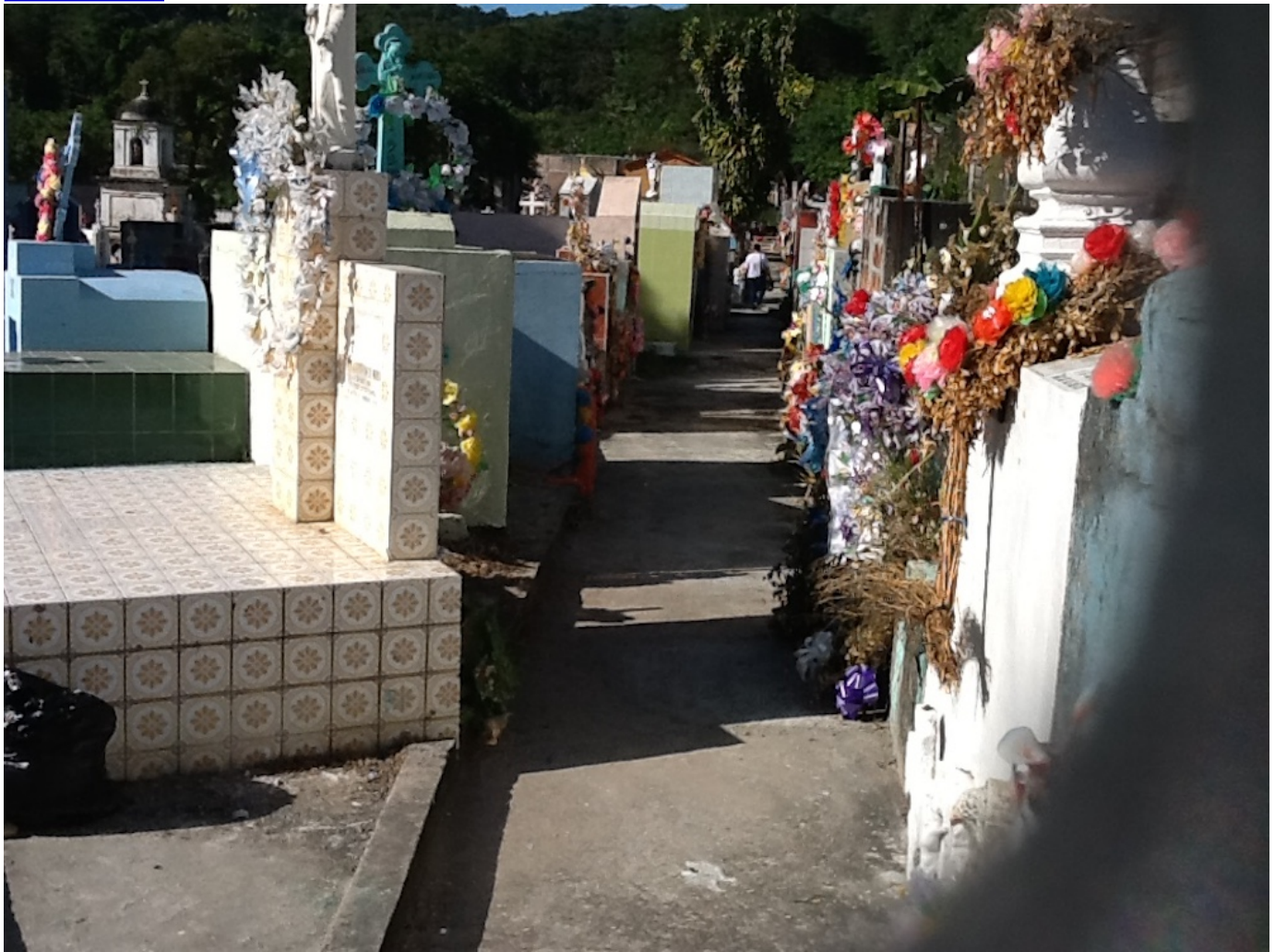
Cemetery where Maryknoll Srs. Ita Ford and Maura Clarke are buried in El Salvador, pictured in 2015