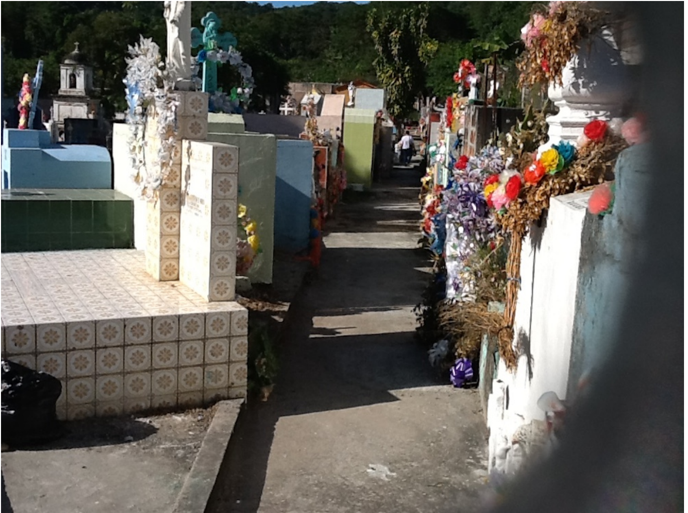
Cemetery where Maryknoll Srs. Ita Ford and Maura Clarke are buried in El Salvador, pictured in 2015