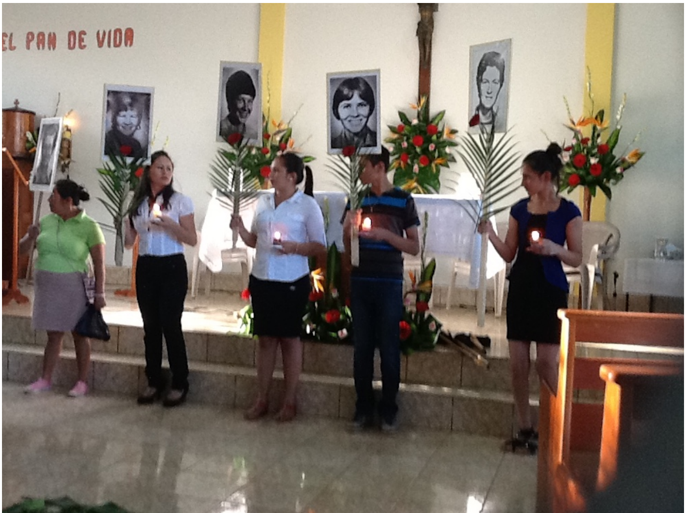
Prayer service in El Salvador village church in 2015 in honor of lay missionary Jean Donovan, Ursuline Sr. Dorothy Kazel, and Maryknoll Srs. Ita Ford and Maura Clarke

So, it's difficult to say what observing this kind of fast means. It's difficult to say where this kind of fast might take us. But the Gospels tell us that now that the bridegroom is no longer with us in body, we can fast. So I suppose that is our role now — to enter deeply into this fast and to understand its dangers and to believe with all our might that no matter where this fast takes us, God will say to us, "Here I am."