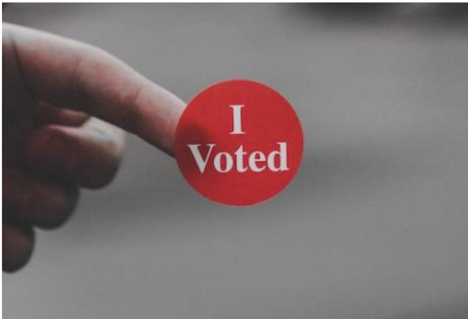
"I voted" sticker

Four years later, our political climate is both frostier and on fire. Yet I am even more convinced that the biggest need is for us to answer this question about hope, across political, and even church, divides.