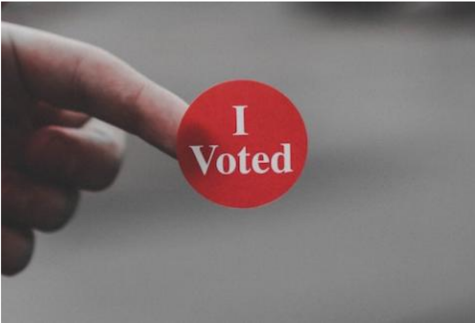
"I voted" sticker

Four years later, our political climate is both frostier and on fire. Yet I am even more convinced that the biggest need is for us to answer this question about hope, across political, and even church, divides.