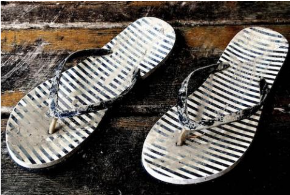
Flip-flop sandals

every day at school was worthy of an award. I duly accepted my certificate, which confirmed that I had attended meetings at a number of local area schools. I felt quite proud of myself and couldn't wait to show off. After a few days of "showing off," I forgot about the whole affair.