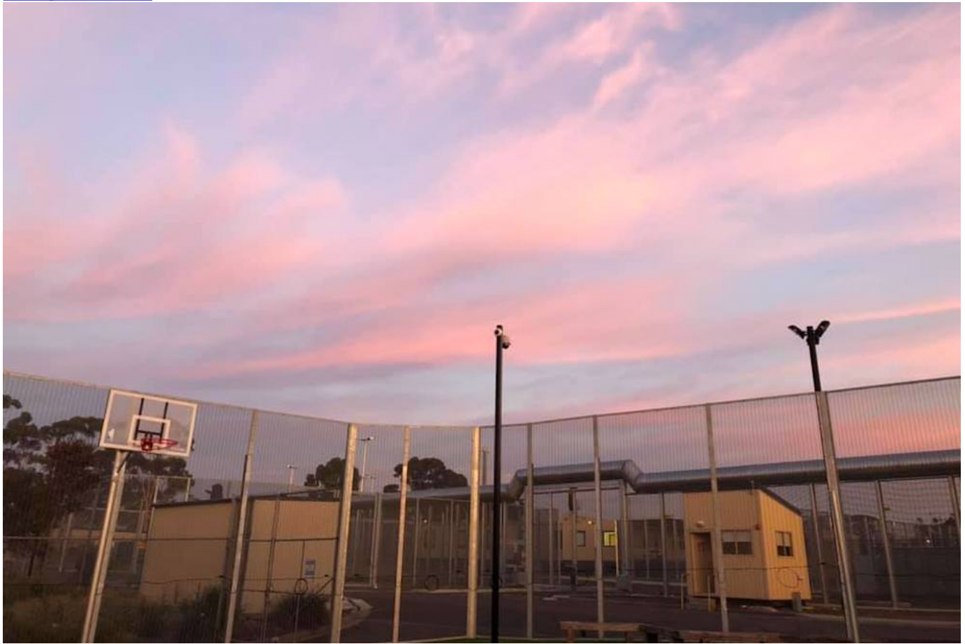
Photo shared with Sr. Rita Malavisi showing the sunrise from inside Melbourne Immigration Transit Accommodation, a detention center in Australia