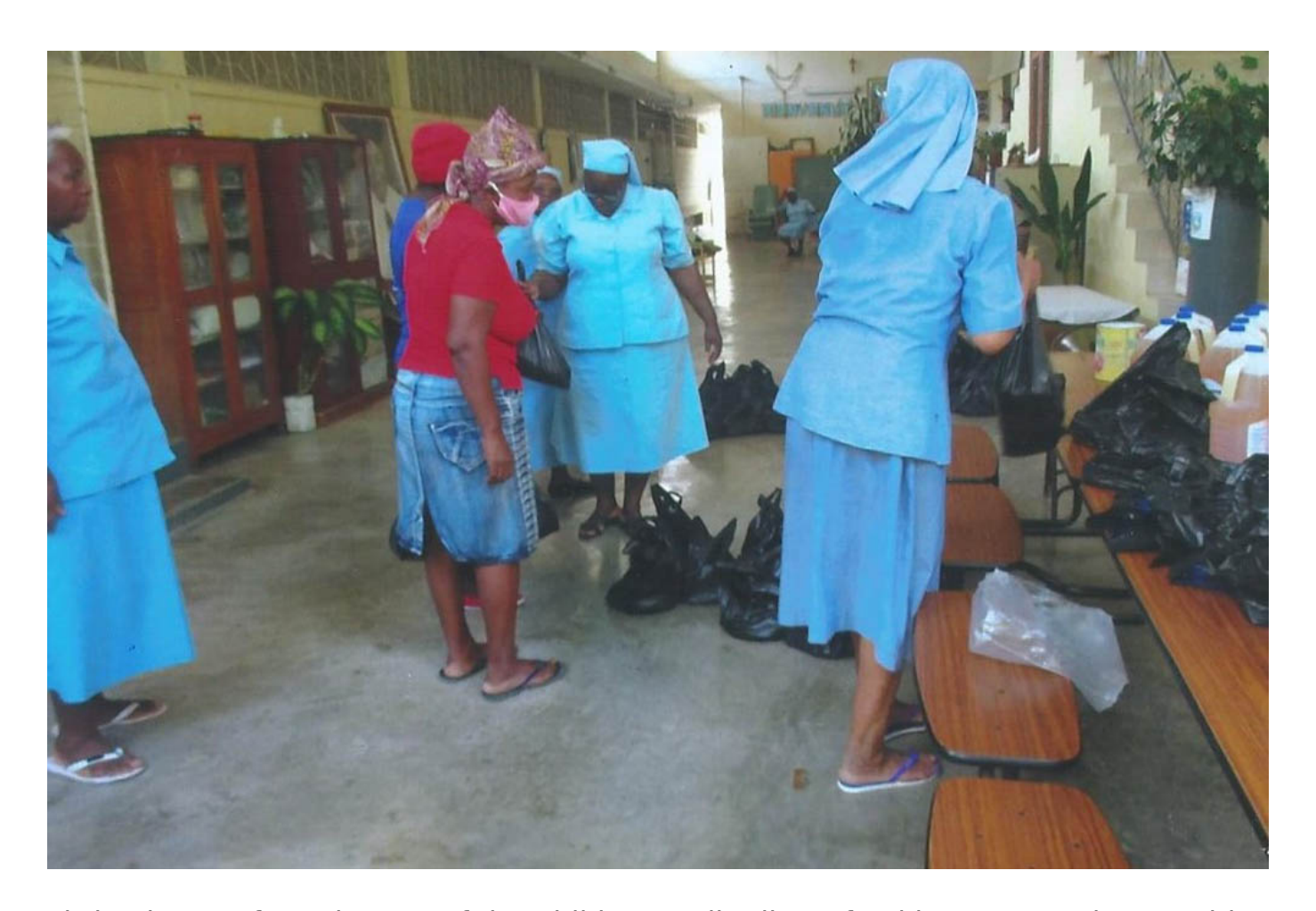
Little Sisters of St. Therese of the Child Jesus distribute food in Port-au-Prince, Haiti, during the COVID-19 pandemic.

Sister Denise says access to electricity is a big problem everywhere, and few families have solar or generator alternatives for food storage; plus, gas prices for generators continue to rise. Frequent market visits become essential in spite of the dangers of lurking infection.