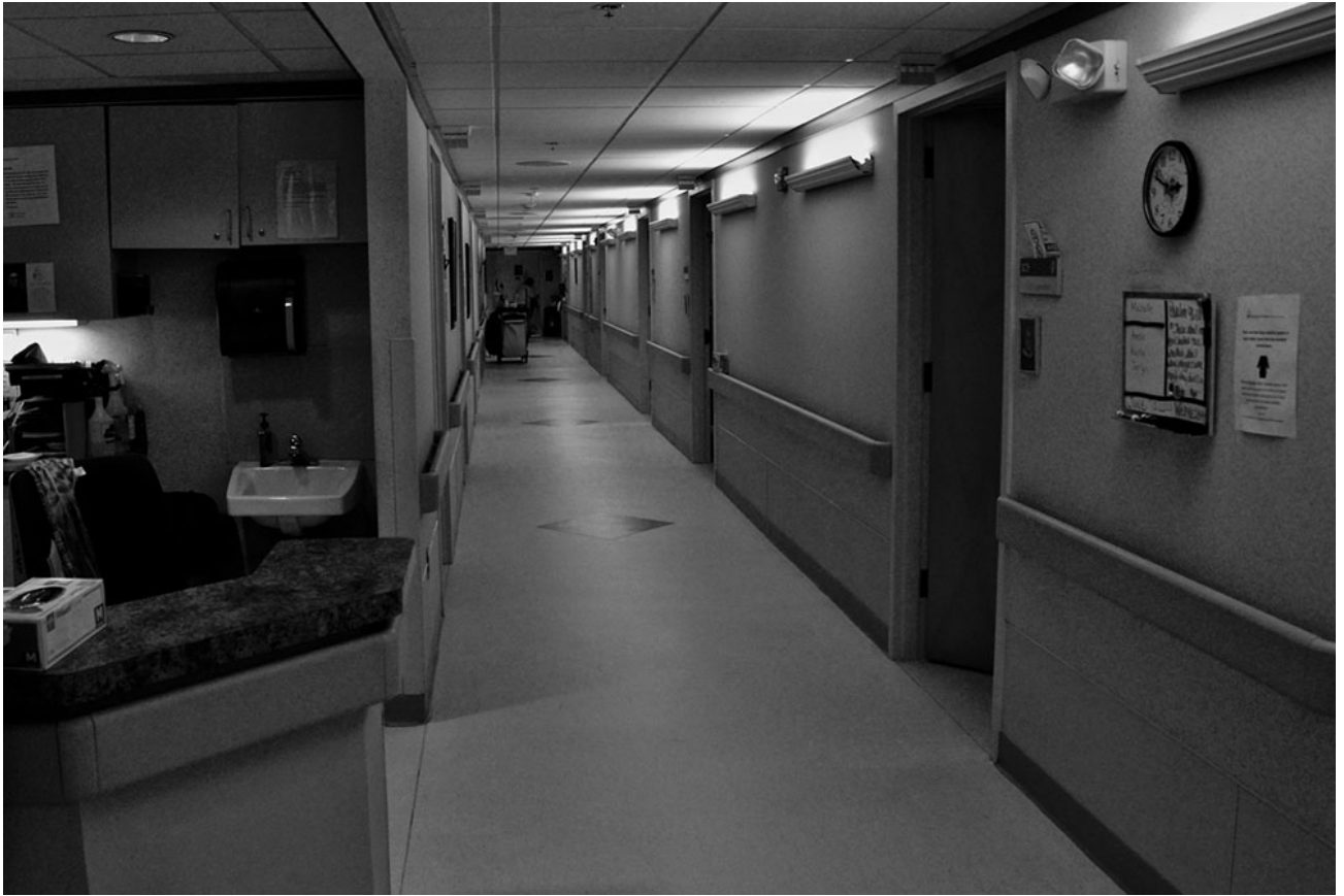
The first floor of the care center in the Felician Sisters' convent in Livonia, Michigan, has many empty rooms after COVID-19 killed 12 sisters in one month. Many of the sisters who died lived on the first floor.