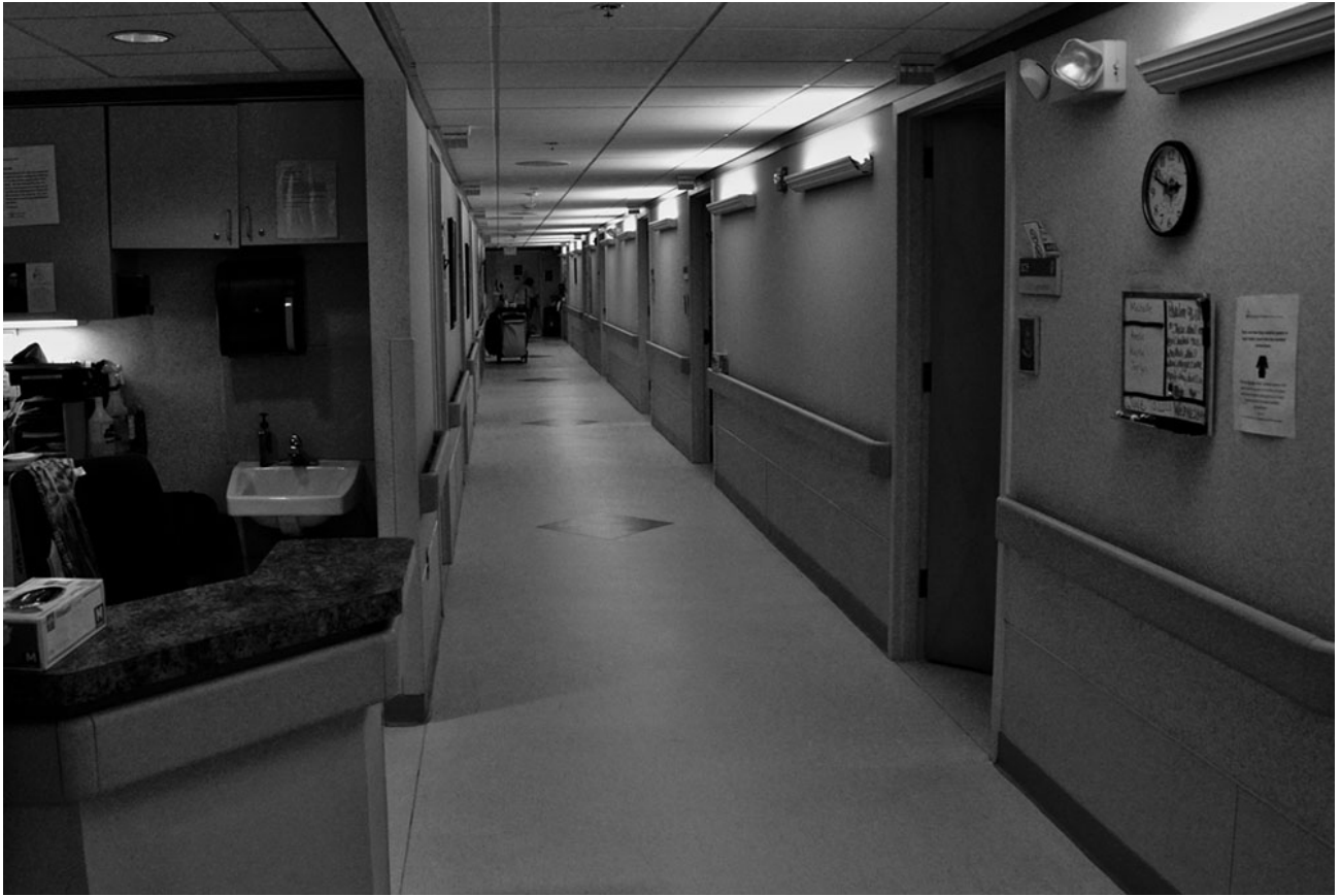
The first floor of the care center in the Felician Sisters' convent in Livonia, Michigan, has many empty rooms after COVID-19 killed 12 sisters in one month. Many of the sisters who died lived on the first floor.