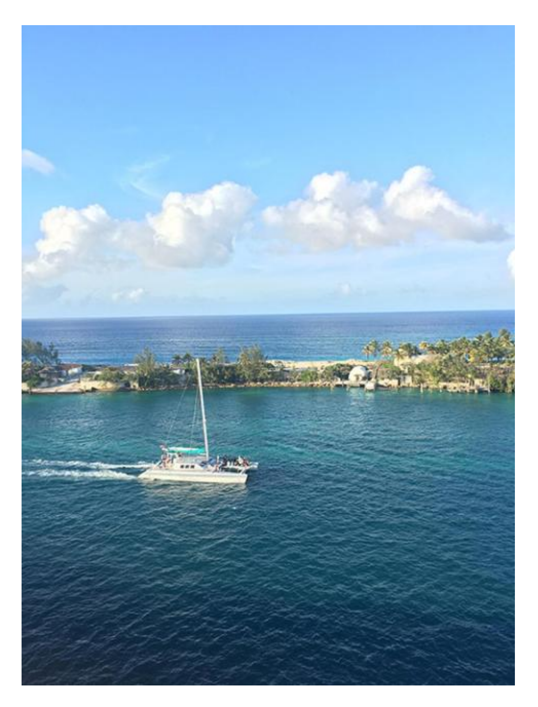
A beautiful day, like the interior of a peaceful heart, in Nassau, Bahamas, last year

I have heard it said that no man is an island. I believe this is true. We are communal beings created for union with another. It is an unfortunate fact that we are unable to interact with each other in the way we normally would or with the frequency we normally would.