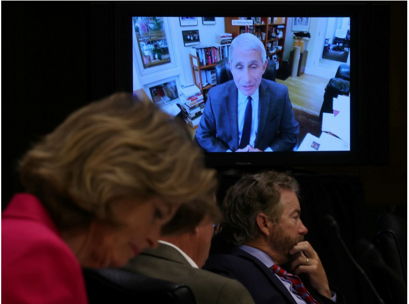
Dr. Anthony Fauci, director of the National Institute of Allergy and Infectious Diseases, speaks remotely during the Senate Committee for Health, Education, Labor and Pensions hearing in Washington May 12.