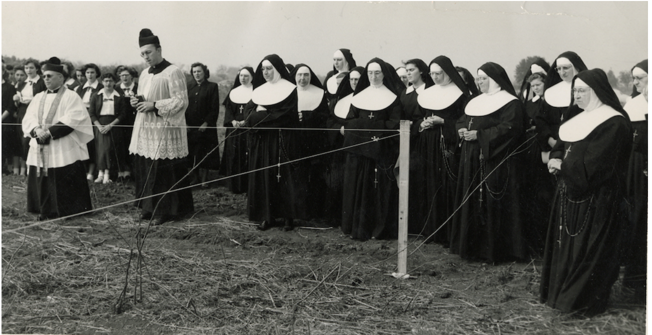
Church officials break ground in 1950 for Mirabeau, the new provincial house of the St. Joseph sisters in New Orleans.