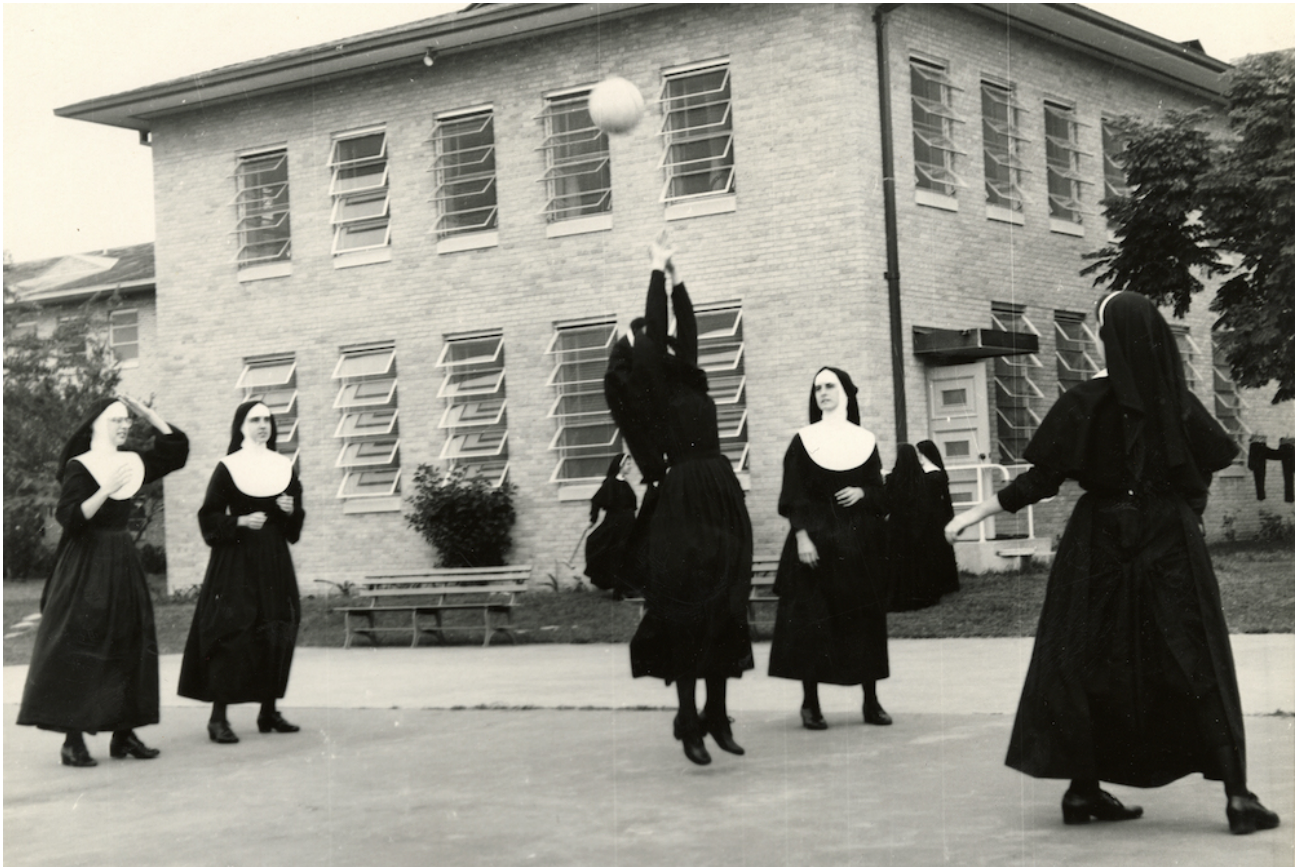
St. Joseph sisters play basketball at the Mirabeau provincial house in New Orleans in 1953. (Courtesy of the Congregation of the Sisters of St. Joseph)

Mirabeau provincial house of the St. Joseph sisters in New Orleans, in 1955 (Courtesy of the Congregation of the Sisters of St. Joseph)