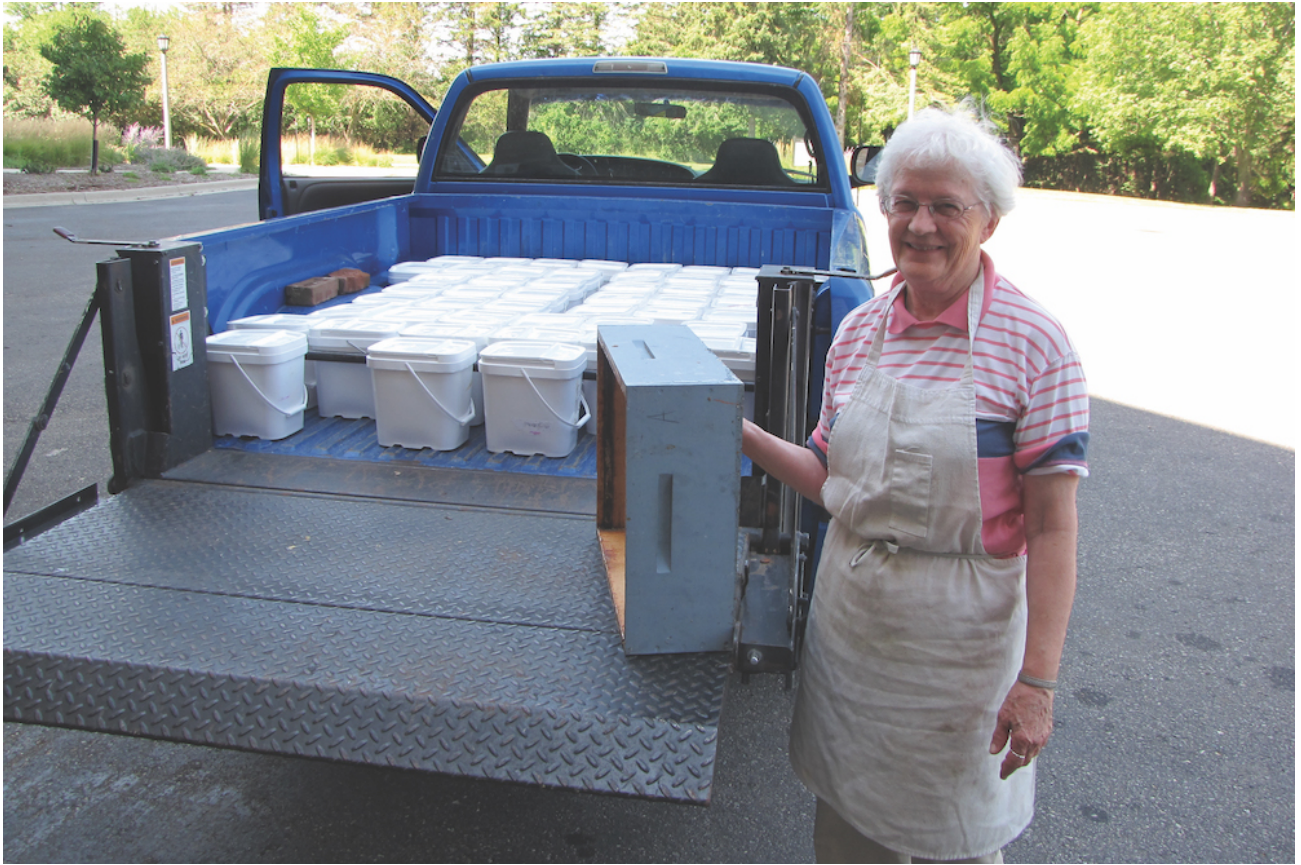
Beekeeper at the Franciscan Sisters of Rochester's motherhouse (Franciscan Sisters of Rochester, Minnesota)

Beehives became a permanent fixture at our motherhouse in 2000 and provide us with honey and wax. Our vegetable garden, flower beds, prairie grass plots and flowering bushes provide the bees with forage while beautifying the environment and removing carbon dioxide, and we educate people about the many dangers bees face today.