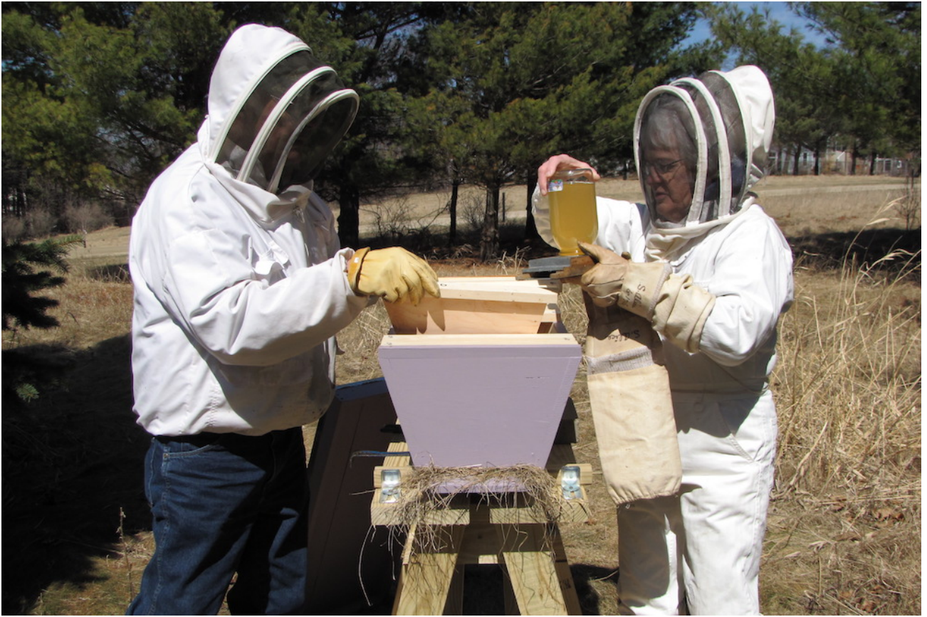
Beekeepers at the Franciscan Sisters of Rochester's motherhouse tend to the bees.