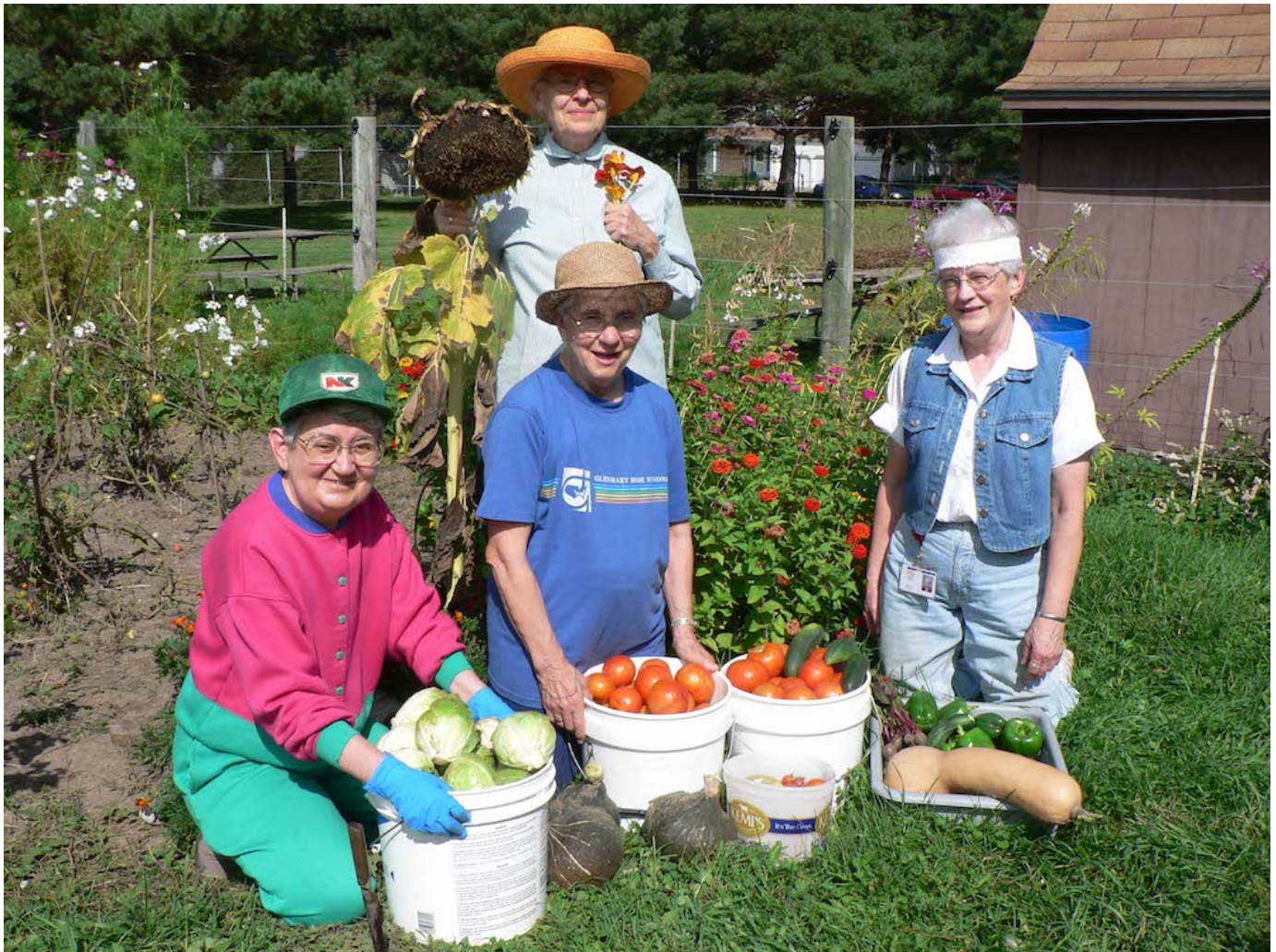
Sister beekeepers and gardeners with some harvest in 2017 (Franciscan Sisters of Rochester, Minnesota)