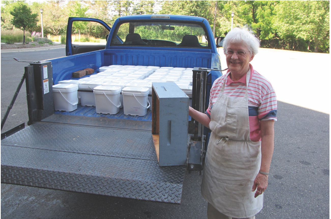
Beekeeper at the Franciscan Sisters of Rochester's motherhouse

Beehives became a permanent fixture at our motherhouse in 2000 and provide us with honey and wax. Our vegetable garden, flower beds, prairie grass plots and flowering bushes provide the bees with forage while beautifying the environment and removing carbon dioxide, and we educate people about the many dangers bees face today.