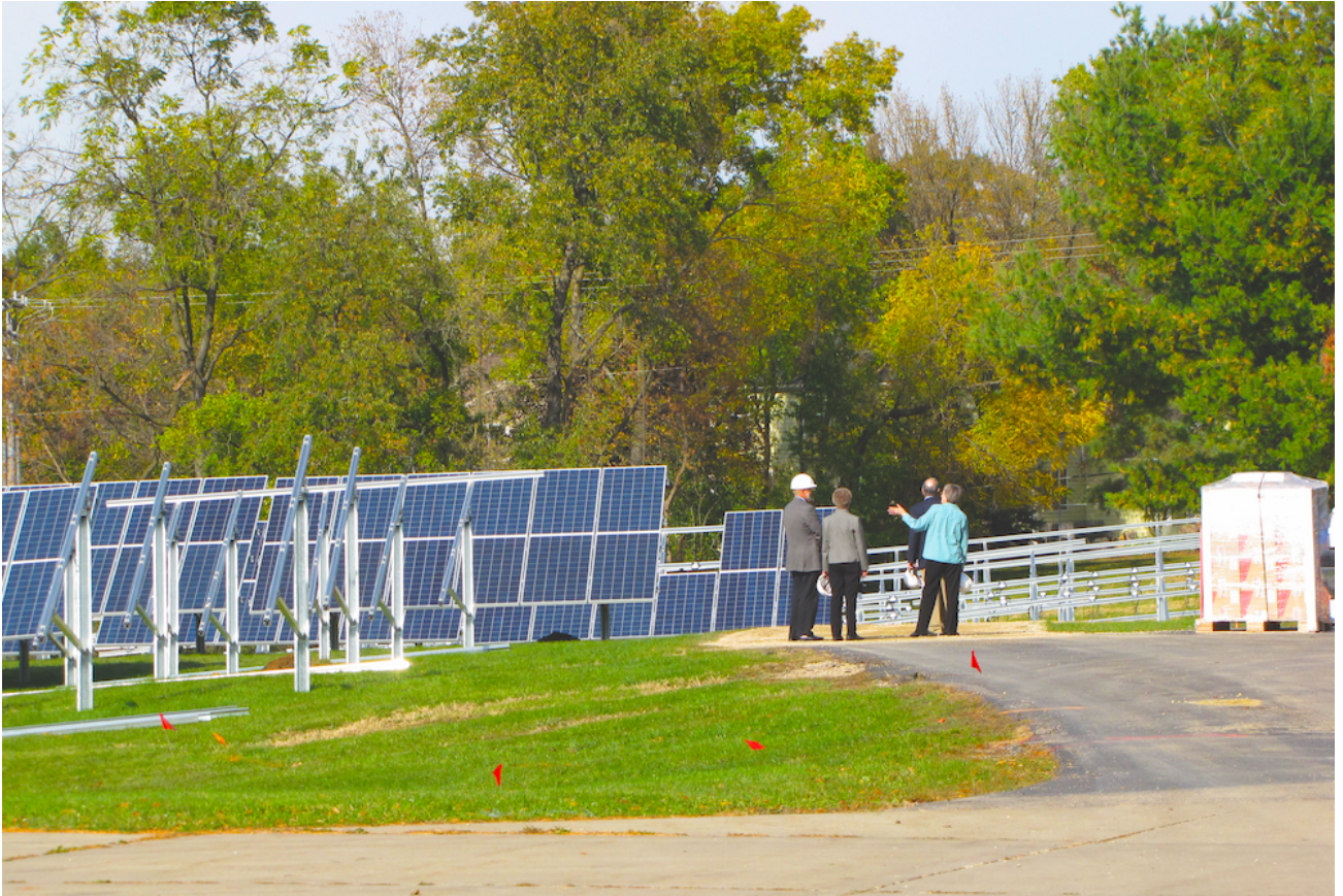
Touring the solar panel array in 2014, when they were about one year old on the property of the Franciscan Sisters of Rochester, Minnesota