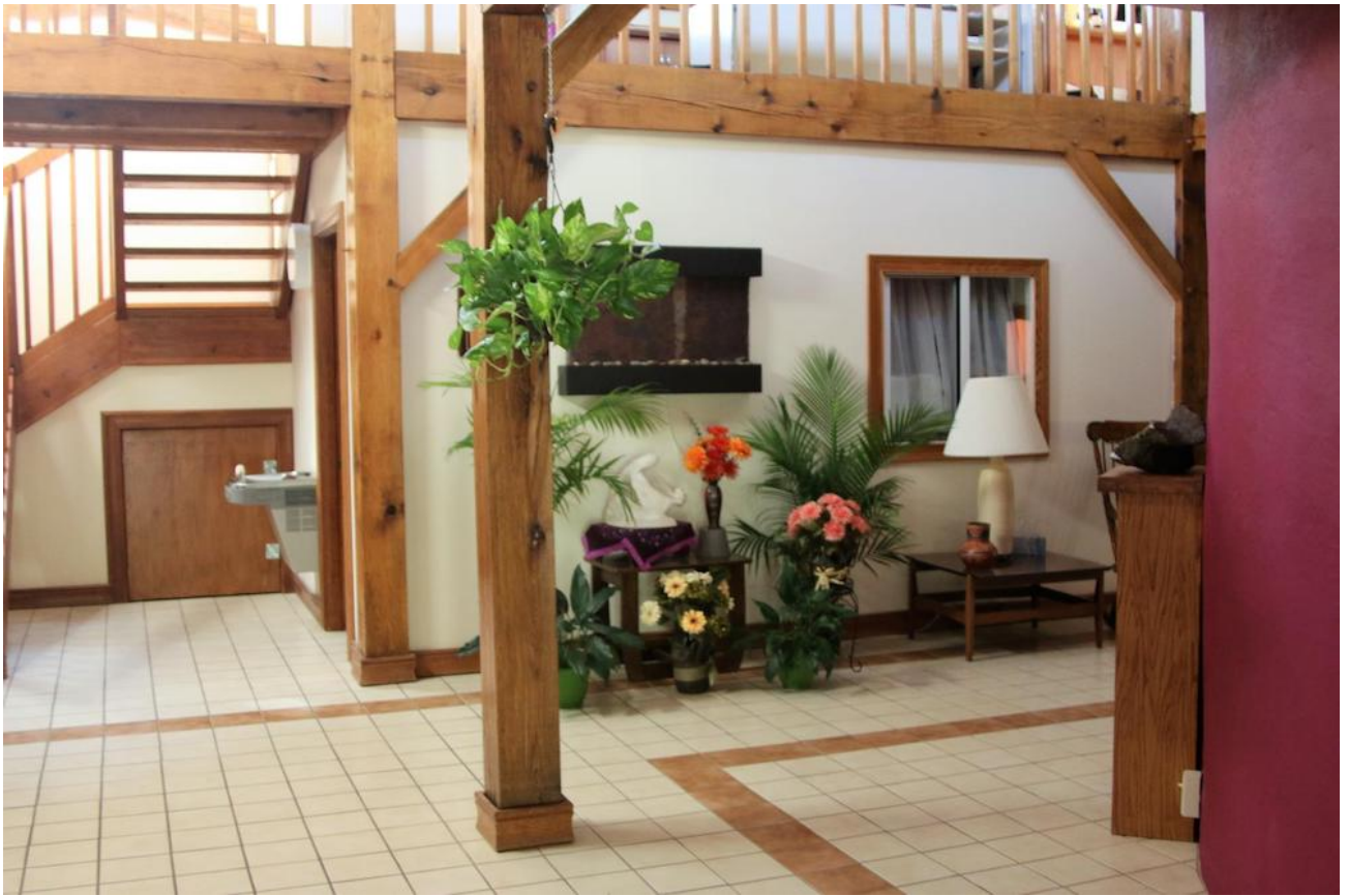
Earth Connection is a remodeled garage with reclaimed wood, furniture, carpeting and an entire wall of recycled aluminum cans and installing a photovoltaic solar panel heating system.