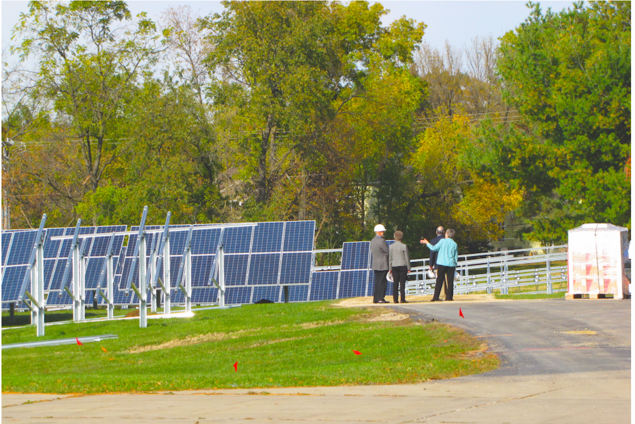
Touring the solar panel array in 2014, when they were about one year old on the property of the Franciscan Sisters of Rochester, Minnesota