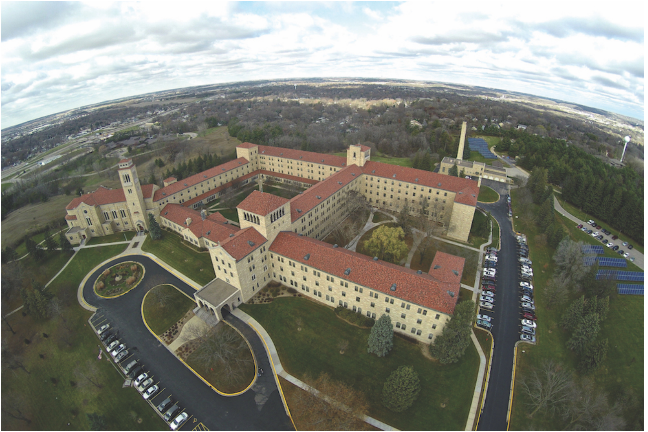
Aerial view of Franciscan Sisters of Rochester's motherhouse in 2018, showing solar panel field to the right of the property