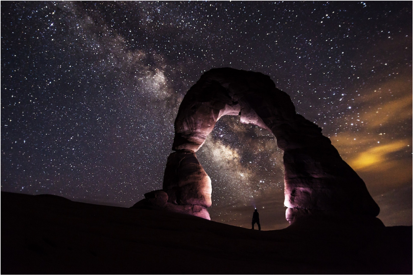
Delicate Arch, Arches National Park, Utah

The great deconstruction began for many of us years ago when studying and implementing in our houses and lifestyles a total respect for sister Earth by implementing "sustainability principles":