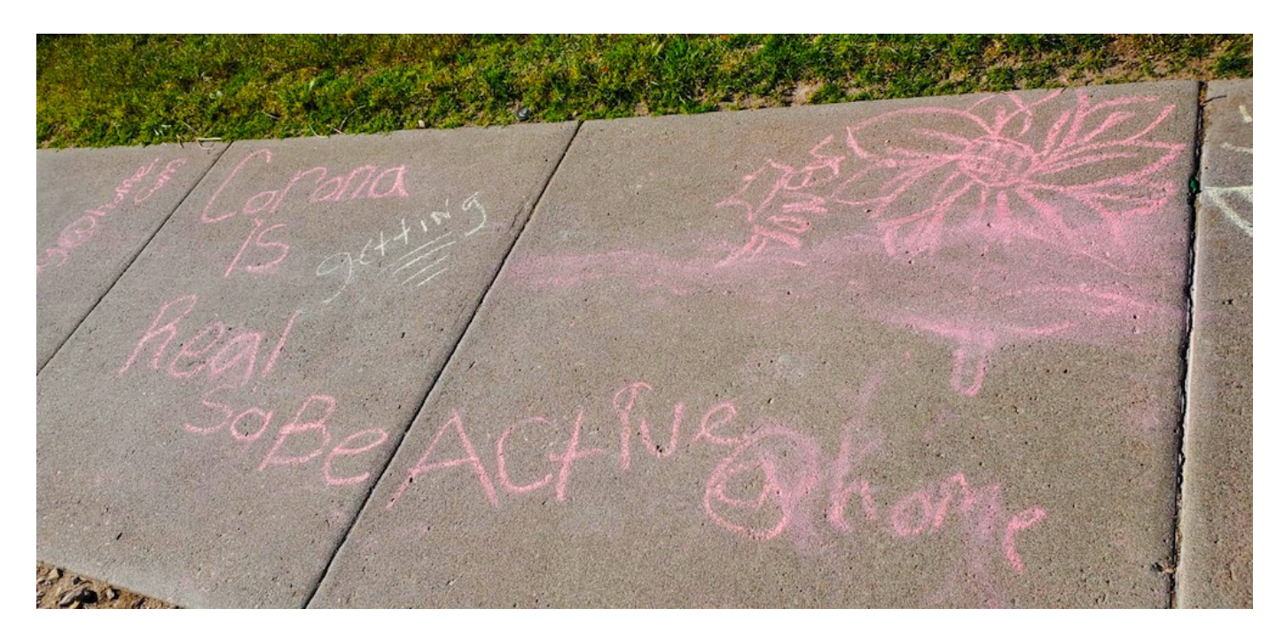
Sidewalk chalk art done by children from a youth shelter in El Paso, Texas