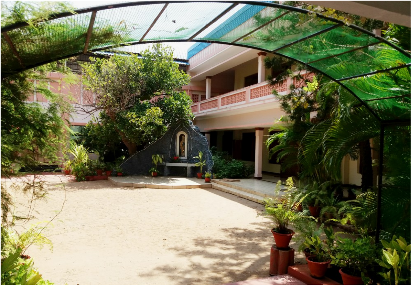
The Franciscan Sisters of St. Aloysius Gonzaga generalate in Puducherry, southern India