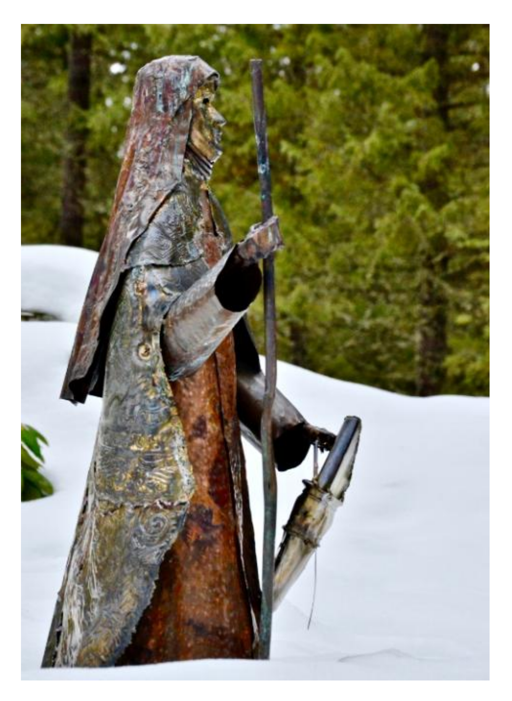
A statue of St. Teresa of Avila stands in the snow outside the community building at the Carmelite Sisters of Mary on Jan. 30 in Newport, Washington.

About 4 feet of snow has fallen so far, but most of it has melted in the last week, so the steep, rocky driveway to the <u>Carmelite Sisters of Mary</u> is passable again. At the top is a cluster of hermitages and a community building that houses the central chapel, marked by a copper statue of St. Teresa of Avila, who looks out over the boulders and trees and the many hiking paths that wind through them.