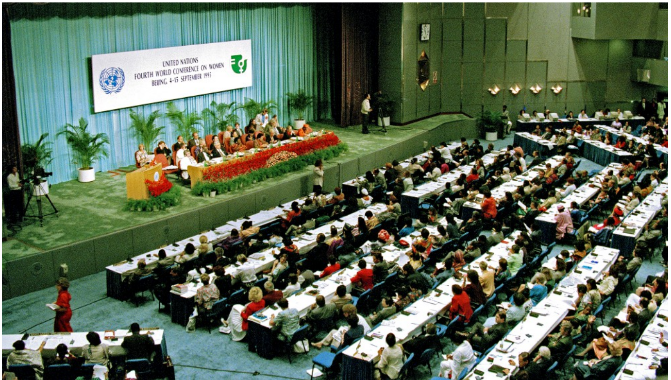
The United Nations Fourth World Conference on Women in Beijing on Sept. 15, 1995

As a result, Beijing and its assertion of human rights for American women is still a promise-in-waiting in a country that won't ratify the ERA — the Equal Rights Amendment for women.