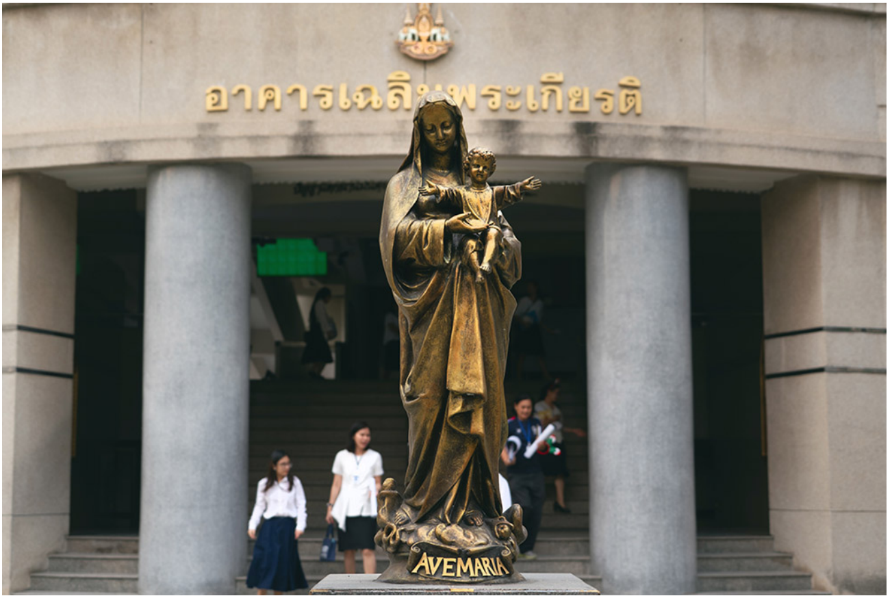
Teachers leave for the winter holiday past an Ave Maria statue at the entrance to the Mater Dei classrooms.