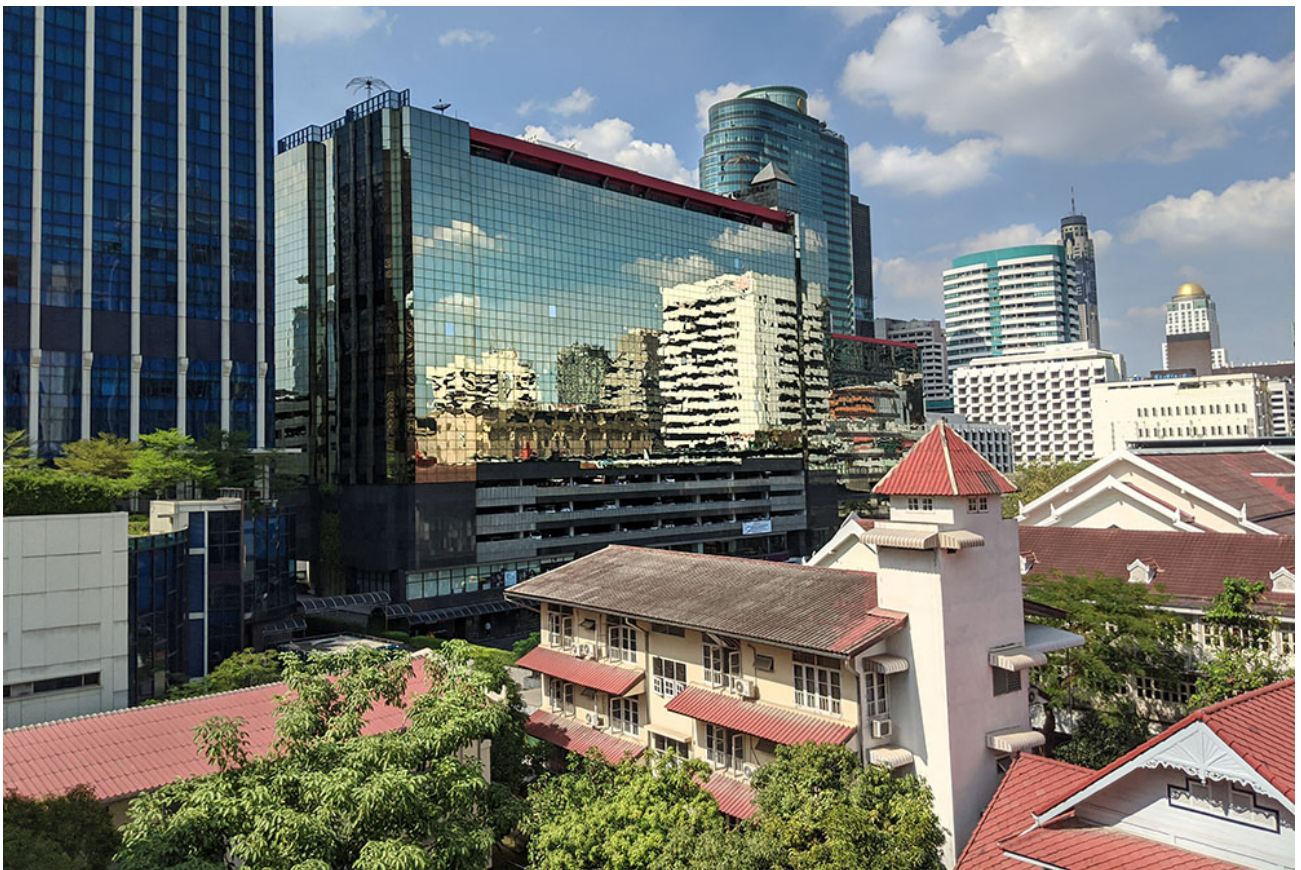
An older section of the Mater Dei campus first developed in 1927 sits below Bangkok skyscrapers.