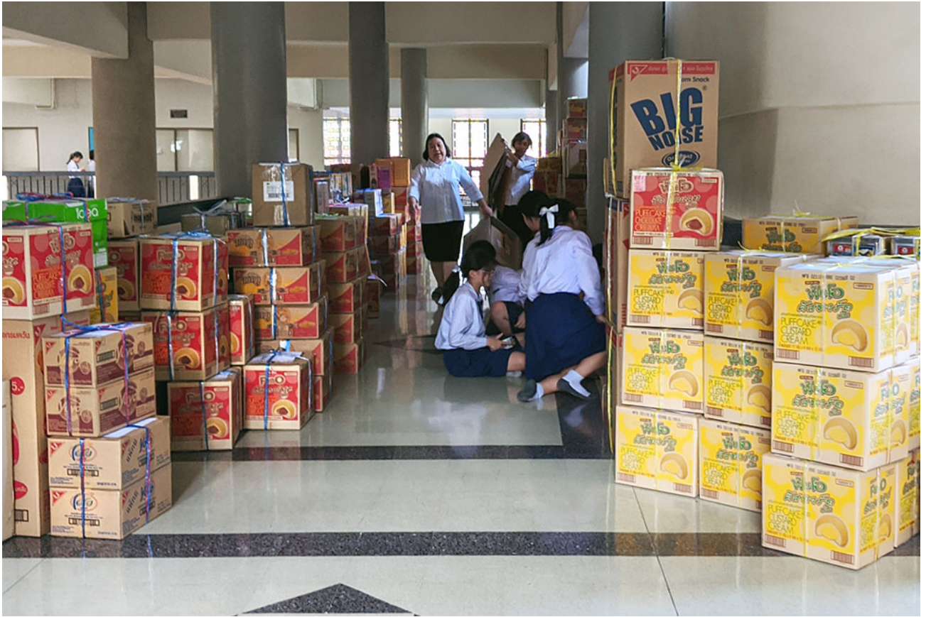
Eighth-grade Mater Dei students prepare supplies for a weekend trip to visit refugee students at a sister school on the Cambodian border.