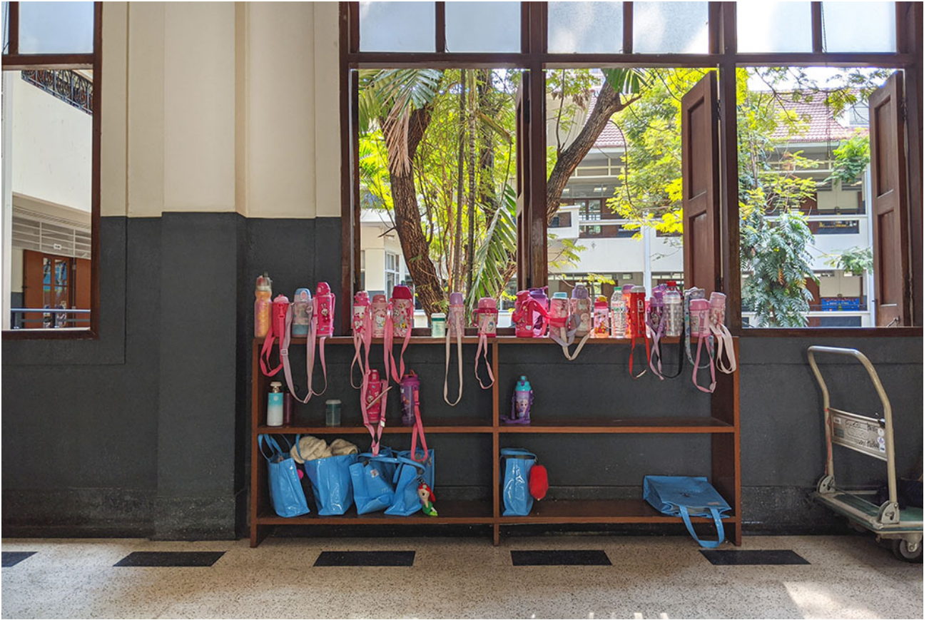
Mater Dei elementary students' homemade lunches sit on a stairway landing.