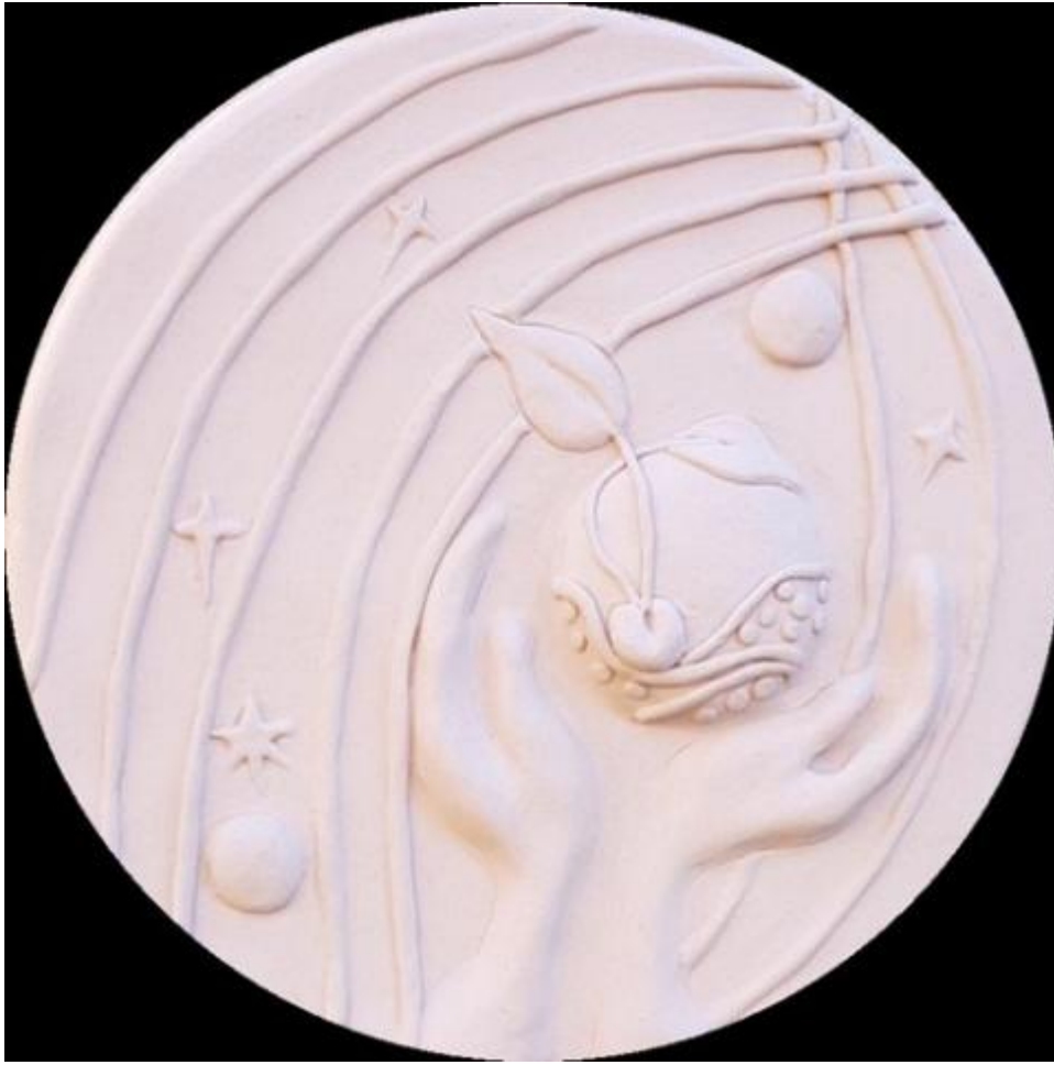
"Bound to Love" sculpture, by Kenise Neill

"Once you bring life into the world, you must protect it. We must protect it by changing the world."