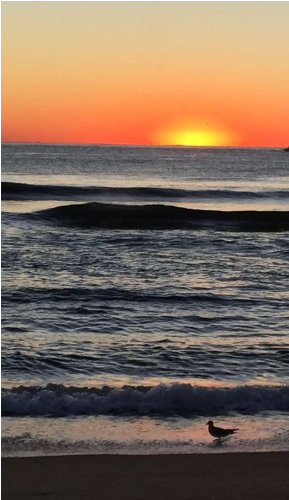
A ring-billed gull at dawn (Mary Bilderback)