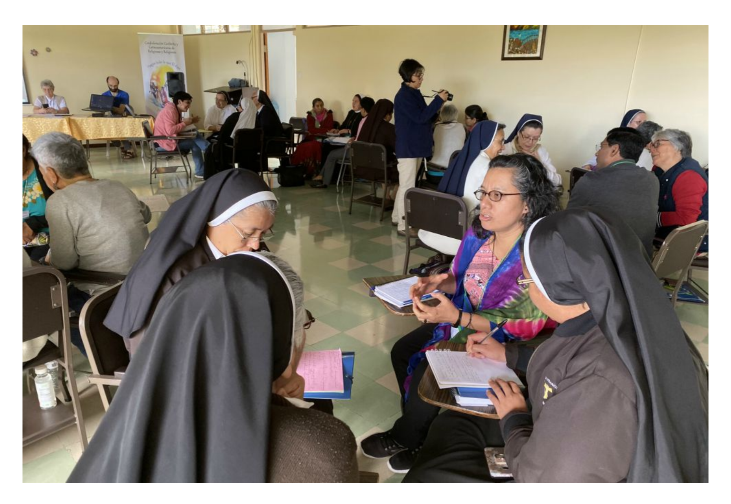
The Nov. 30-Dec. 2, 2019, CLAR gathering was an opportunity for religious involved in ecology in their respective Latin American countries to network and share experiences.