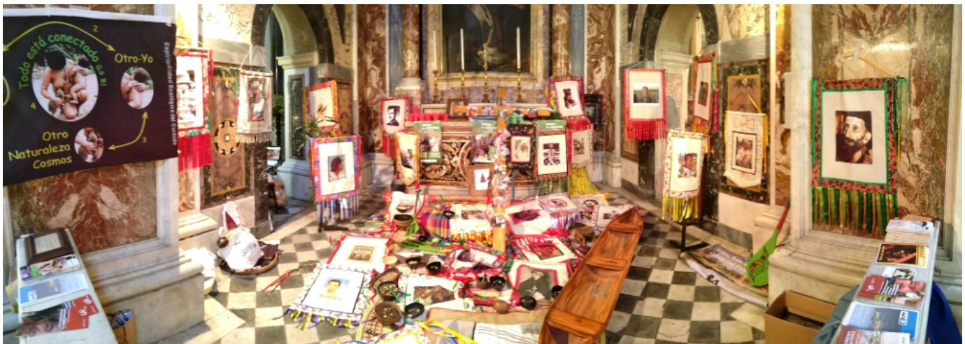
The "Tent of the Martyrs" displays images of martyrs and witnesses of faith in the Amazon region inside the Santa Maria in Traspontina church near the Vatican during the Oct. 6-27 Amazon synod.