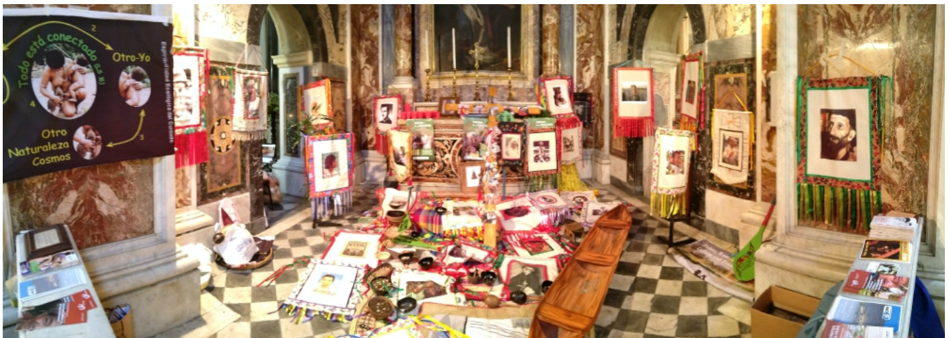
The "Tent of the Martyrs" displays images of martyrs and witnesses of faith in the Amazon region inside the Santa Maria in Traspontina church near the Vatican during the Oct. 6-27 Amazon synod.