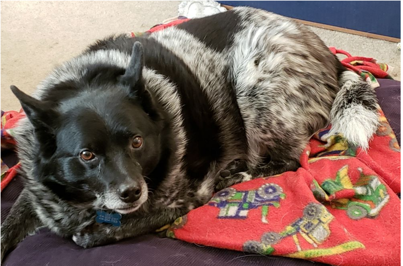
Oreo these days, with her winter fleece blanket

Local community life has changed for varied reasons, and more and more of us live singly, but Oreo keeps me accountable and balanced. She needs me for food and water and exercise and wellness, so I can't get too caught up in "me." As I watch her muzzle gray and see how stiff she is in the sometimes unforgiving weather, I know our time together is limited.