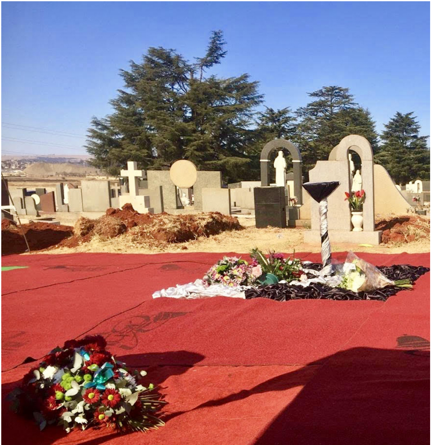
A cemetery in South Africa (Chardonnay Loonat)