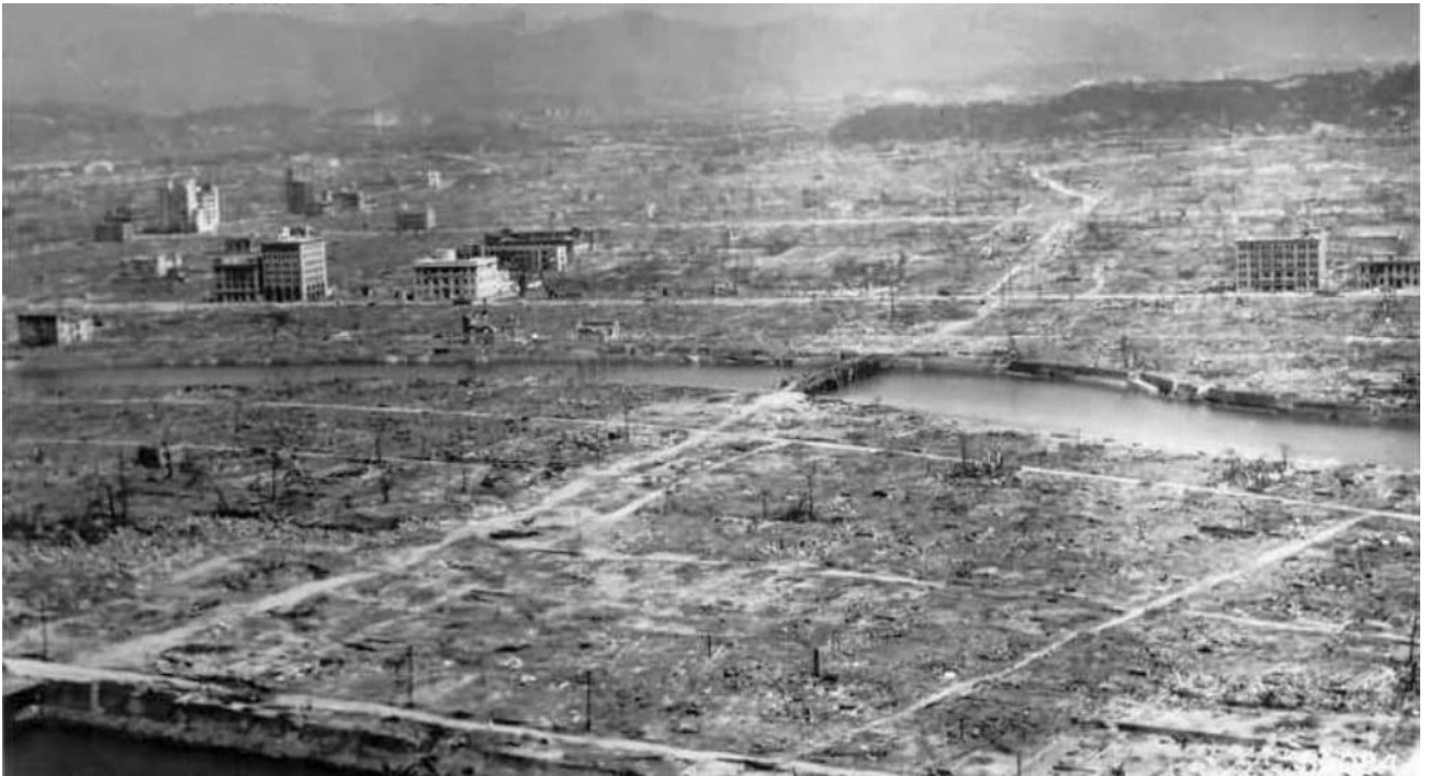
Hiroshima, Japan, Aug. 6, 1945