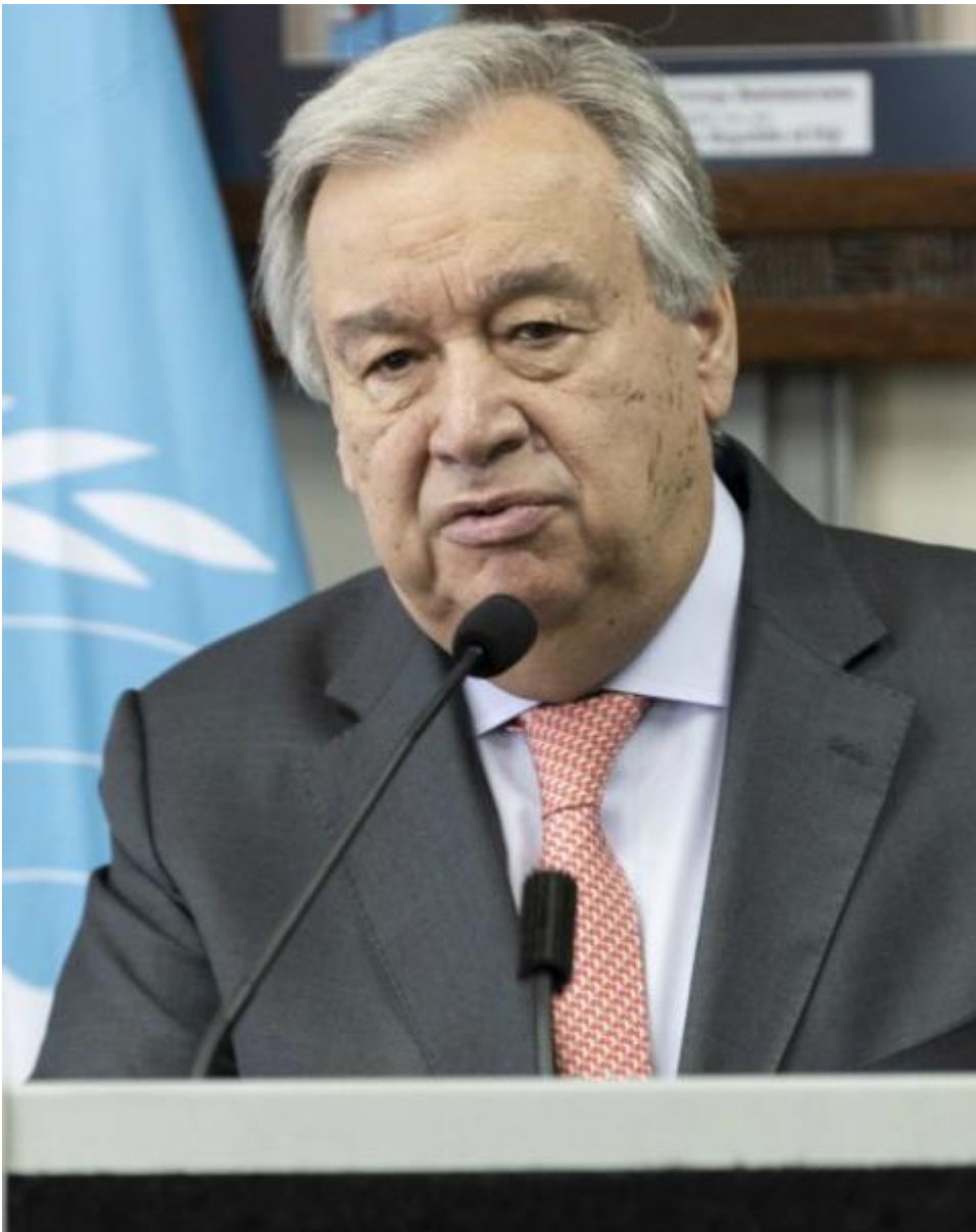
United Nations Secretary-General António Guterres

In addition to the nearly 14,000 nuclear weapons in the world, countries possessing such weapons "have well-funded, long-term plans to modernize their nuclear arsenals. More than half of the world's population still lives in countries that either have such weapons or are members of nuclear alliances."