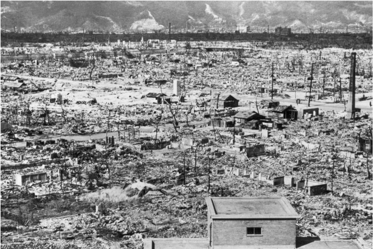
View from Red Cross Hospital, Hiroshima, Japan, after atomic bombing, 1945