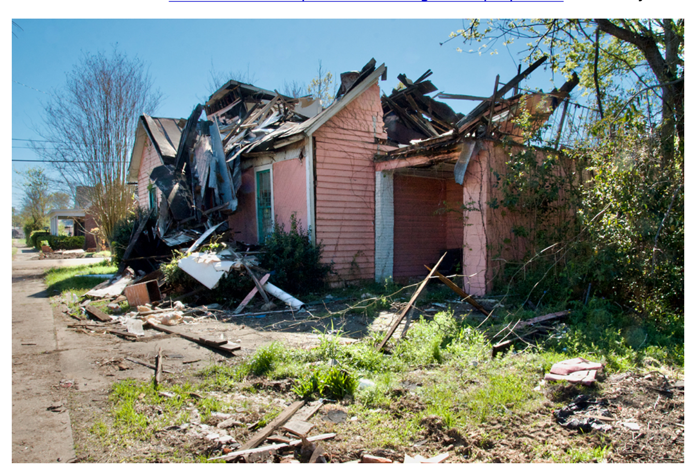
A Jan. 12 tornado wrecked half the residential neighborhoods in Selma, Alabama. Neighborhoods were still filled with rubble in March.