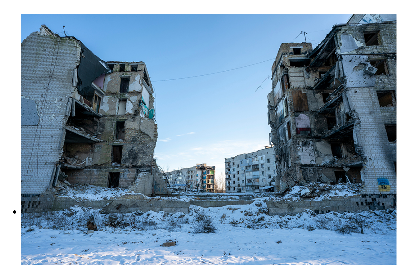
The center of this apartment complex in Borodyanka, Ukraine, collapsed when a Russian missile hit it on April 5, 2022.