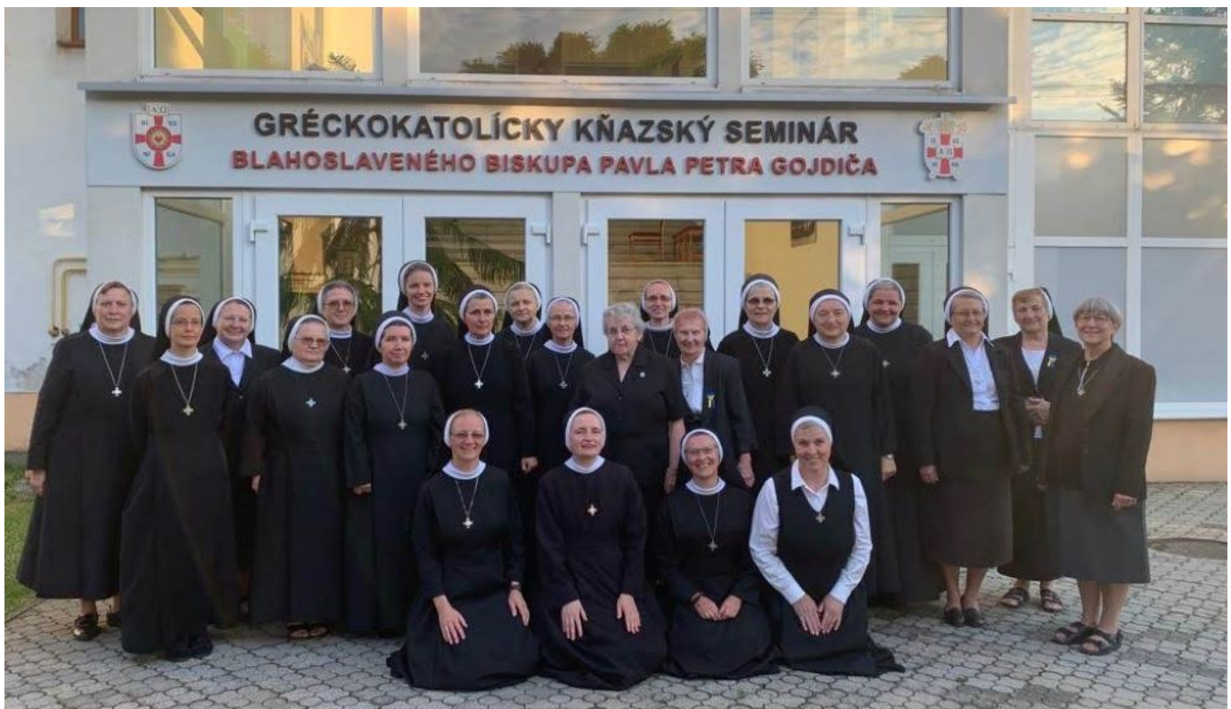
The Council of the Basilian Sisters meets in August 2022 in Preshov, Slovakia.

It is important for us to help the sisters, the people they cared for, but above all, to be there, expressing our closeness and emotional support. On that day, I felt how much my presence among the sisters in Ukraine meant to them. I visited Ukraine for the second time in July to celebrate the perpetual vows of four Basilian Sisters. At that time, the initial fear and confusion in the society had been replaced by endurance and a determined willingness to work long-term for victory.