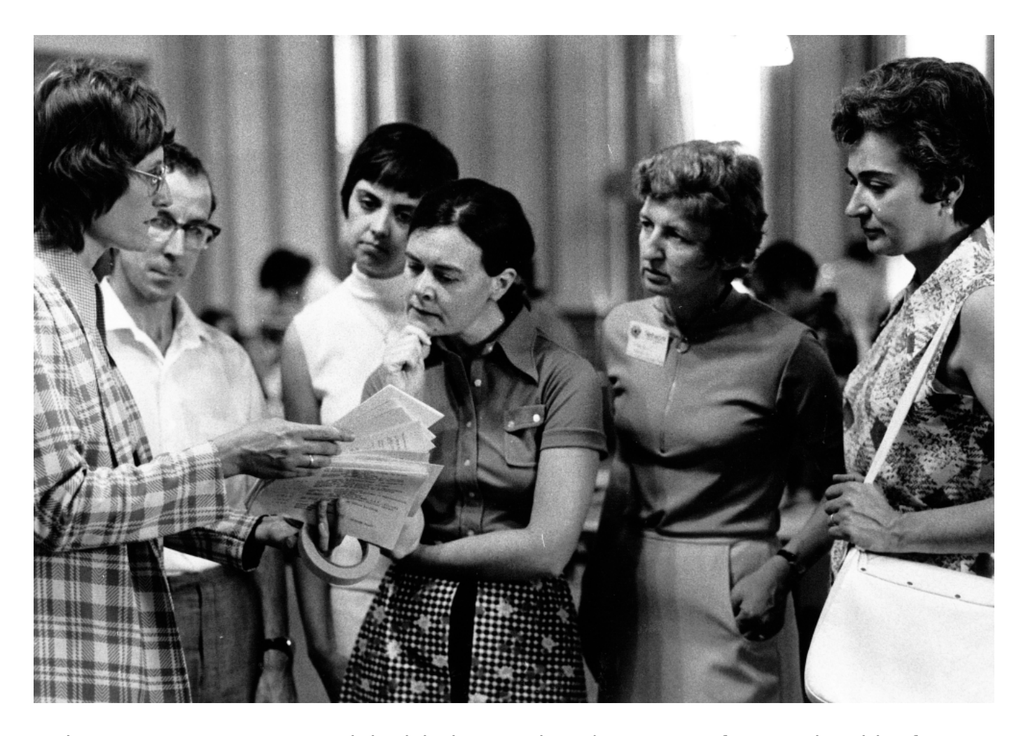
Delegates at a 1974 Network legislative seminar