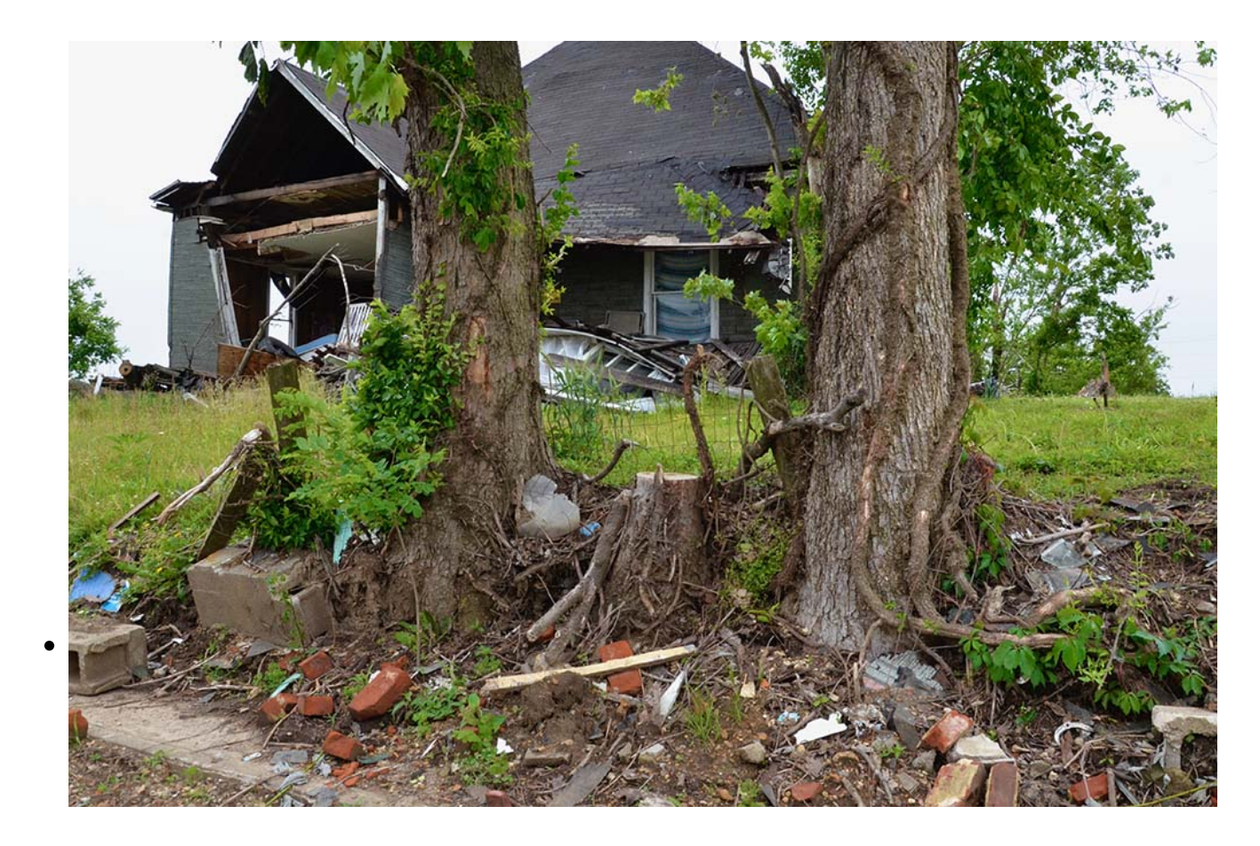
A home damaged by a Dec. 10 tornado awaits demolition May 23 in Mayfield, Kentucky.