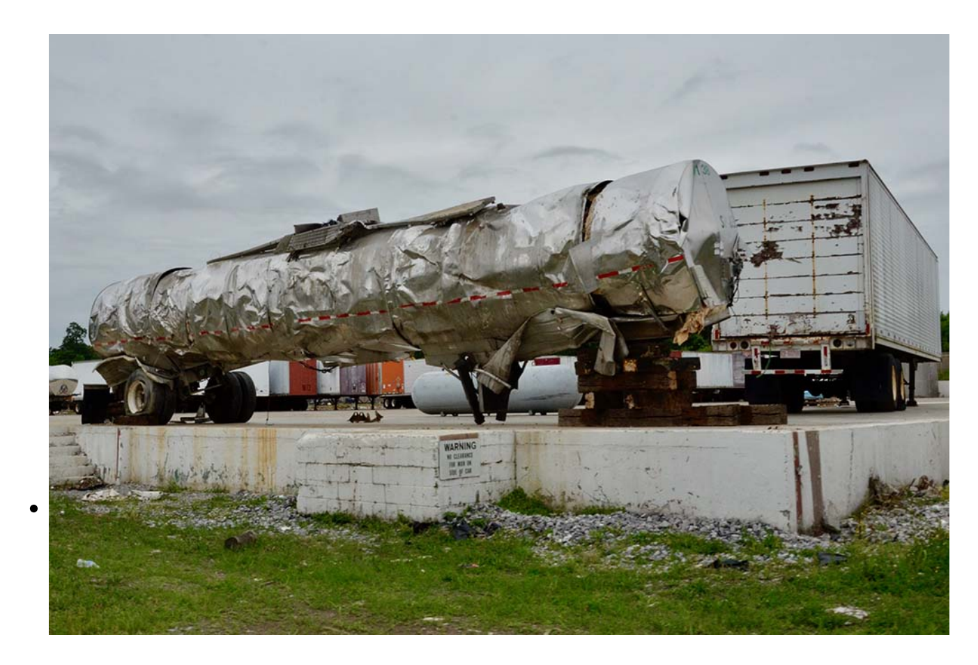
A tanker damaged by the Dec. 10 tornado in Mayfield, Kentucky, sits in a parking lot May 23 in Mayfield.