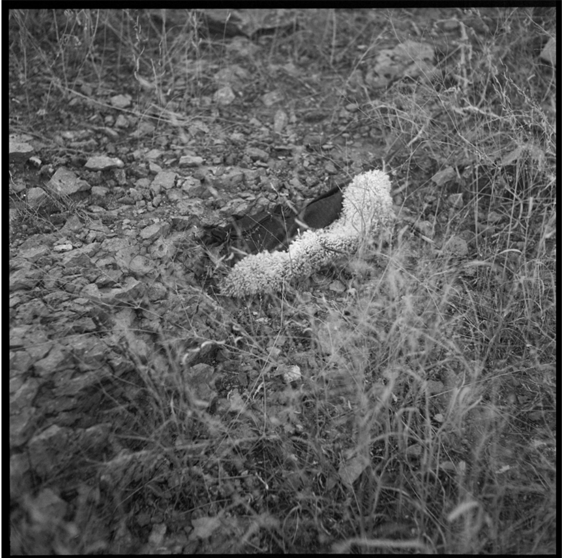
A discarded carpet shoe is used to mask footprints in the desert dust and is worn over the top of regular shoes. (Lisa Elmaleh)