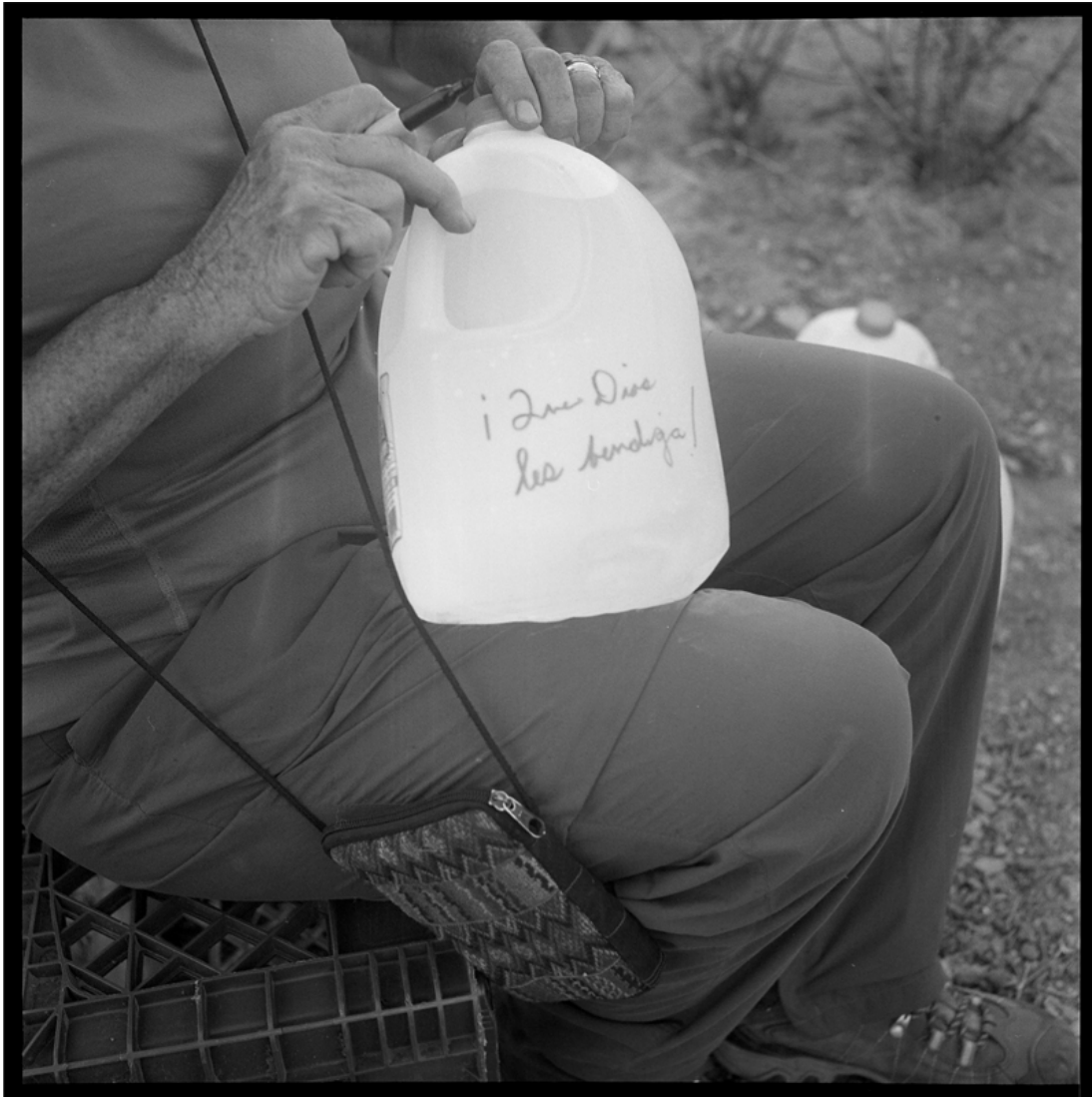
Messages are written on the water bottles left, wishing the migrants blessings and luck.