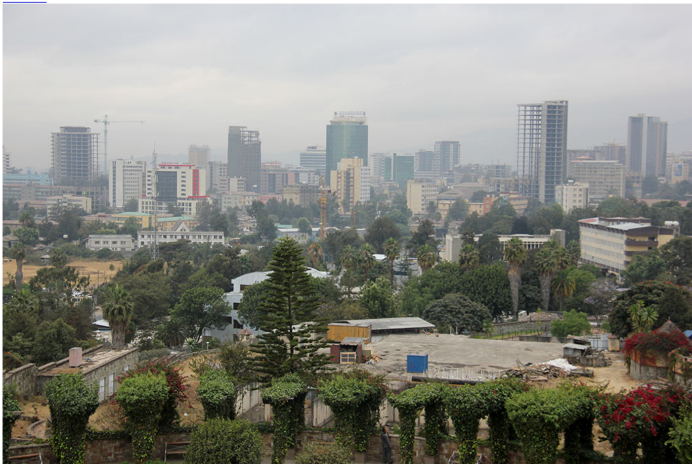
A view of Addis Ababa, Ethiopia