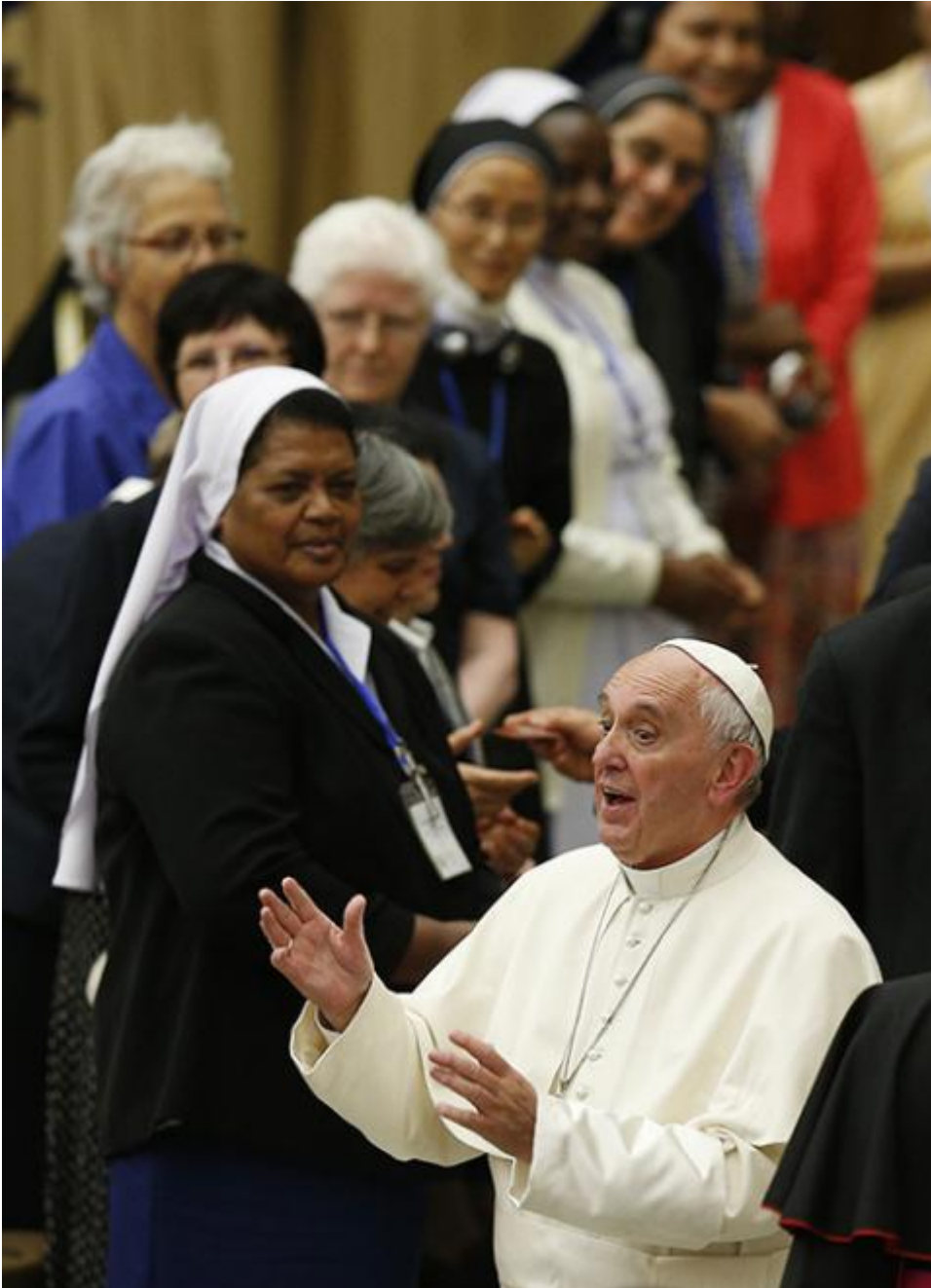
Pope Francis gestures during an audience with the members of the International Union of Superiors General in Paul VI hall at the Vatican May 12, 2016.

The pope responded immediately, naming 12 scholars the following August to the Commission for the Study of the Diaconate of Women who met in Rome four times and returned a report by June 2018. The pope gave a portion of the report to the UISG leadership at their May 2019 assembly . It has not been published.