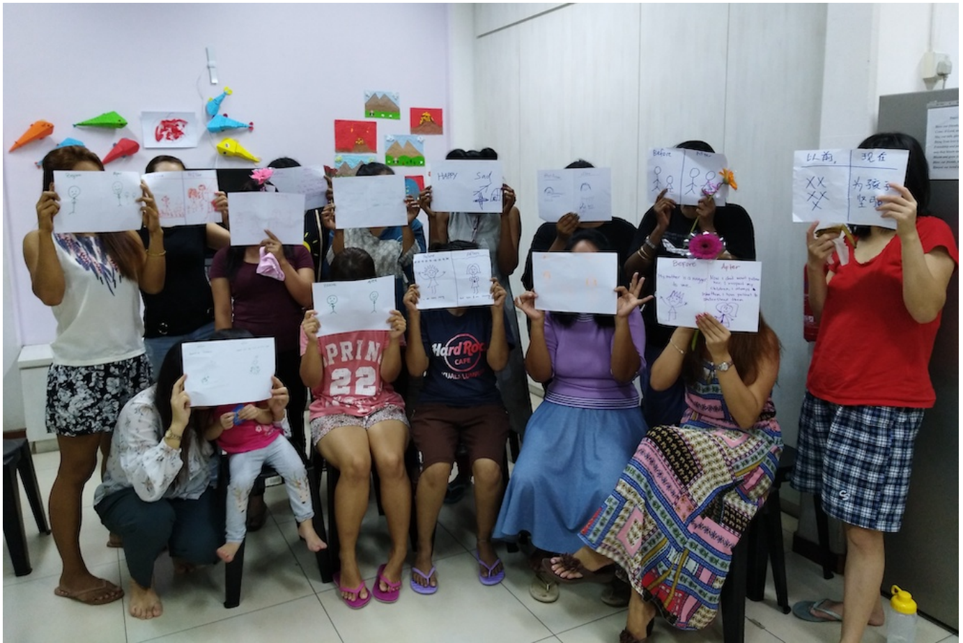
International women and children at Good Shepherd Centre in Singapore pose together before the pandemic began. (Provided photo)