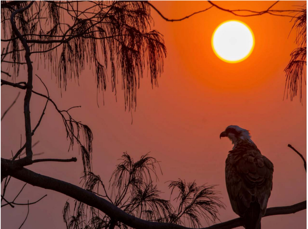
An osprey is seen against the smoke-filled sky at sunrise near Kingscliff, New South Wales, Australia.

We have been deeply moved by our courageous firefighters, putting their lives on the line, and have been saddened that some have died in doing so. In unprecedented evacuations, families have had to flee, taking shelter in designated centers or on beaches, often not knowing if their homes have been saved. Whole townships have been burnt. In some places, water systems, electricity and telecommunications have failed.