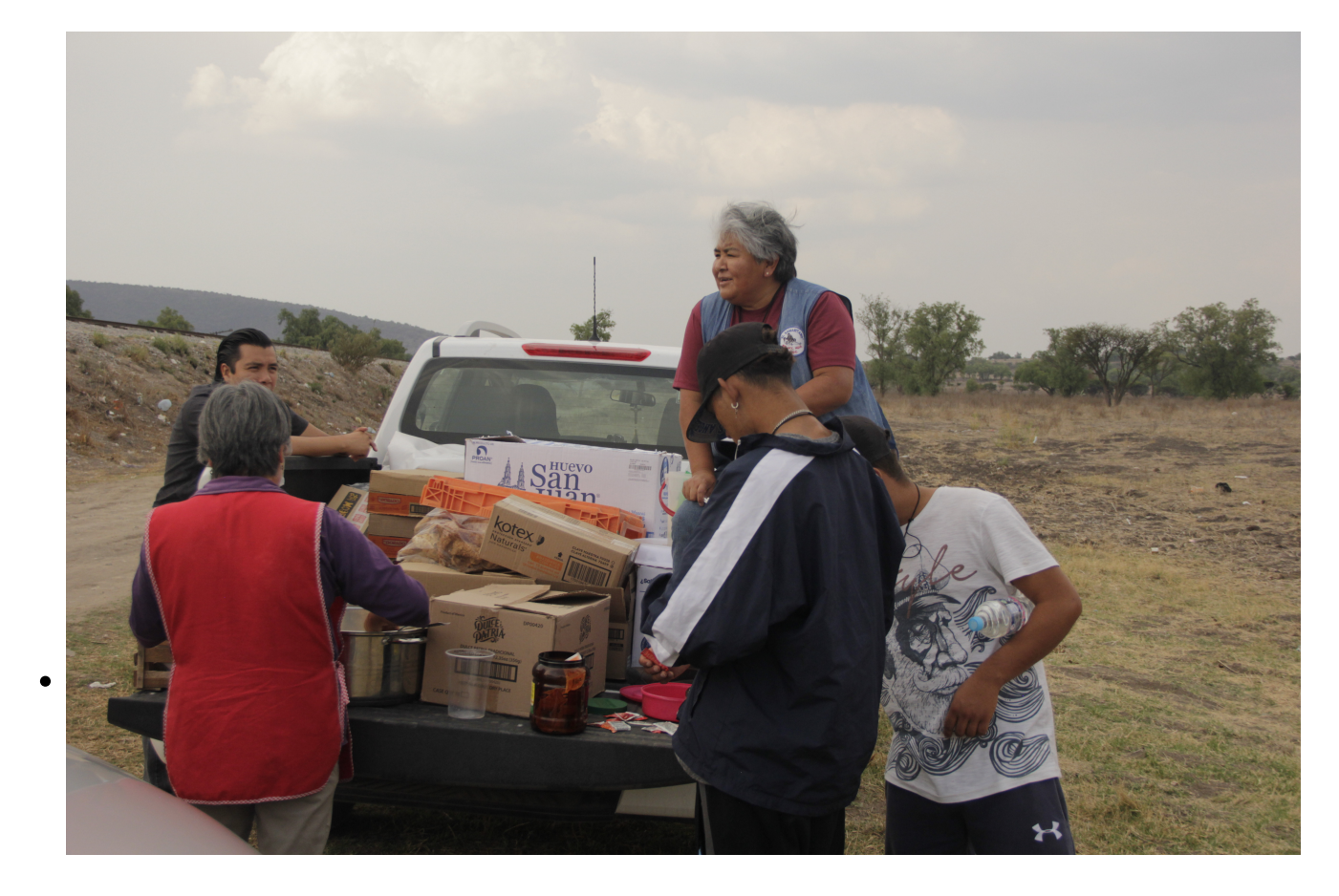
People in transit are fed with what the Sisters of the Sacred Hearts of Jesus and Mary carry as they travel.