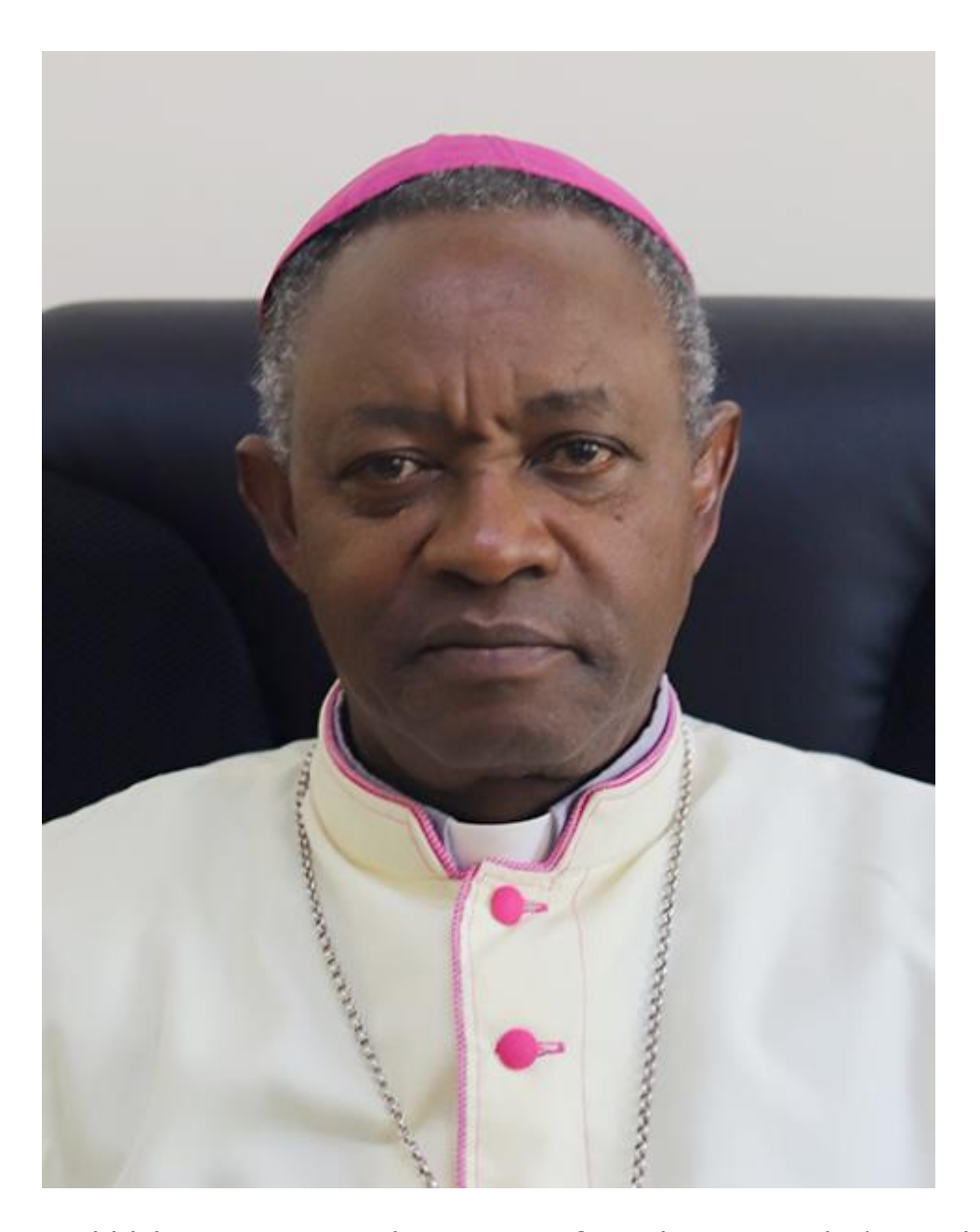
Archbishop Isaac Amani Massawe of Arusha, Tanzania

One of the nuns from the Arusha Archdiocese, in northern Tanzania, speculated that the archbishop had been threatened and compromised by the authorities to support the eviction of the Maasai people.